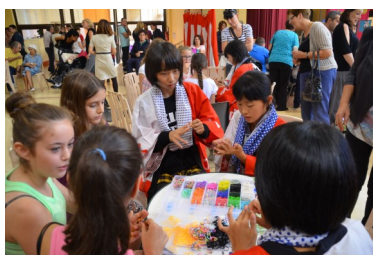
Visit by the junior high school students of Misasa Town to Lamalou-les-Bains in 2014