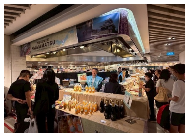
Visitors interested in Hamamatsu products