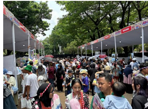
Exhibits by Japanese local governments