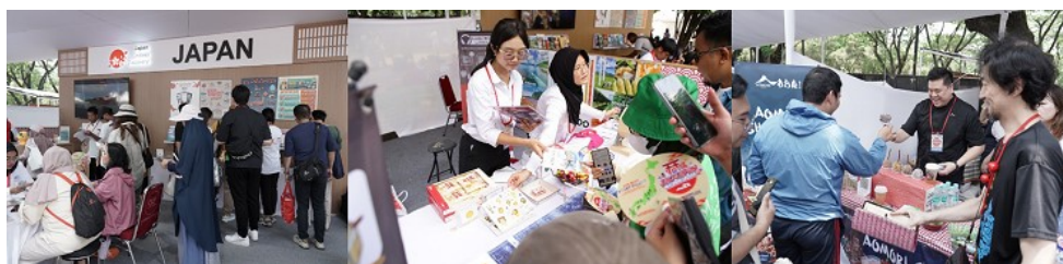
Each regional booth implemented creative promotional efforts

In September 2025, "Jak-Japan Matsuri", Indonesia's largest Japanese cultural event was held. The event featured mikoshi procession, parade floats, and a wide range of performances by popular artists from Japan and Indonesia, providing visitors an opportunity to experience the passion and appeal of Japanese culture. In addition, local governments hosted booths under the theme "Traveling Through Japan." In Indonesia, where interest in Japan is growing, showcasing the attractions of local areas is expected to be highly effective in drawing attention to Japan's diverse regions.