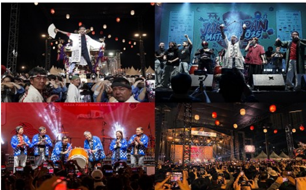
The diverse performances