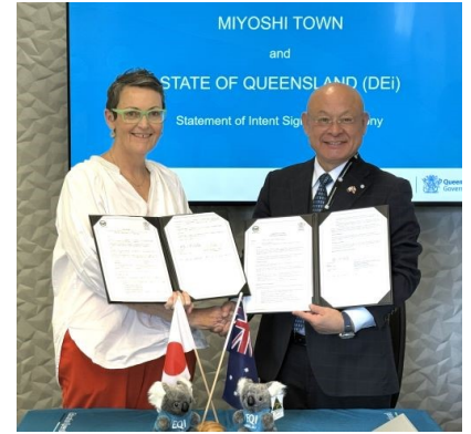
Signing of the agreement with EQI

A group of 20 junior high school students from Miyoshi Town in Saitama Prefecture visited Queensland, Australia, where they gained valuable learning experiences through homestays and interactions at local schools. Also, Miyoshi Town became the first municipality in Japan to sign a cooperation agreement with the Queensland Department of Education's Education Queensland International (EQI), opening up new pathways for students to step out into the world. Building on the friendships and learning fostered across borders, Miyoshi Town's international exchange initiatives are embarking on an exciting new stage.