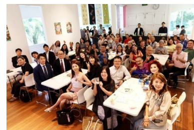
JCC event, with participants from a wide range of fields

I n August 2025, Hamamatsu City organized the "Hamamatsu Fair" in Singapore, successfully showcasing the appeal of its food, traditional industries, music, and tourism. Local specialties such as eel and mandarin orange juice were met with enthusiastic demand, quickly sold out. The city also co-hosted a special event with the Japan Creative Centre (JCC) of the Embassy of Japan in Singapore. Through tastings and cultural presentations, led to new business opportunities, and effectively promoted Hamamatsu's charm overseas.