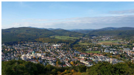
The cityscape of Berndorf viewed from Guglzipf