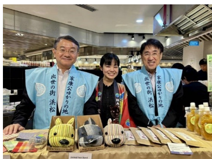
The Mayor of Hamamatsu and the City Council Chairman, introducing local products to visitors at Isetan Scotts