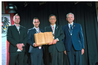
Commemorative gift presentation from Berndorf City (left: new president of the Friendship Association, center: mayors of both cities, right: former president)