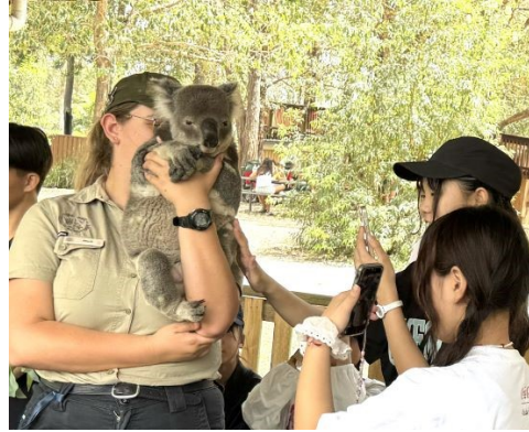
Experiential learning at Lone Pine Koala Sanctuary