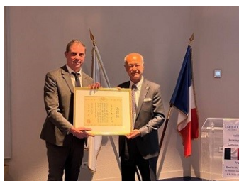
The ceremony presenting the Foreign Minister's Commendation