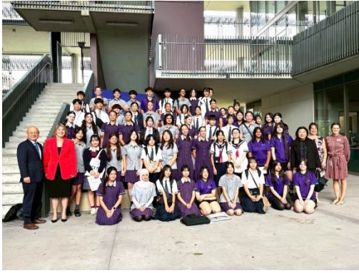
Group photo at the host school