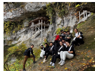
Visit by the junior high school students of Lamalou-les-Bains to Misasa Town in 2025

M isasa Town, Tottori Prefecture and Lamalou-les-Bains, France marked the 35th anniversary of their sister city relationship in 2025. They were also awarded the Foreign Minister's Commendation for their long-standing friendship. This article introduces the exchanges between the two municipalities, including mutual visits by junior high school students who serve as a bridge between the two cities.