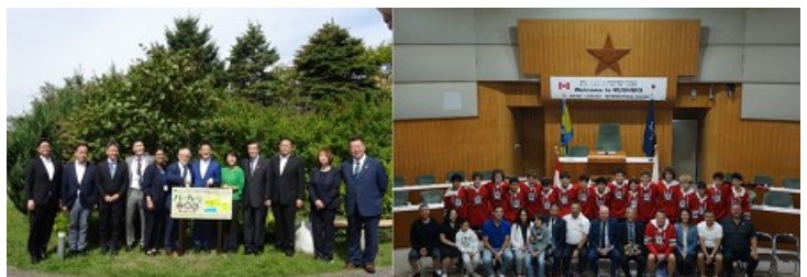
(Left) Unveiling ceremony for the “Burnaby Path” sign (Right) Ice hockey team from Burnaby, Canada, paying a courtesy visit to Kushiro City

T he sister city relationship between Kushiro City and Burnaby, Canada, celebrated its 60th anniversary this year. Delegations from Burnaby visited Kushiro, and vice versa. This article introduces the wide range of exchanges between the two cities.