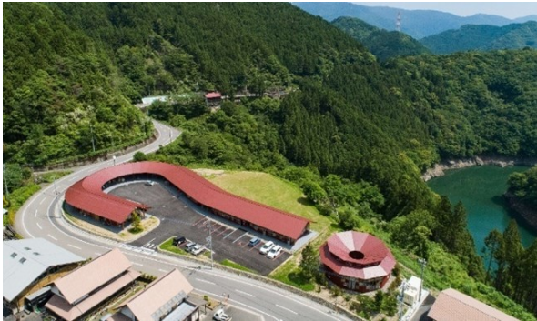
Kamikatsu Zero Waste Center: A public facility equipped with a waste sorting station, multi-purpose hall, and accommodation.