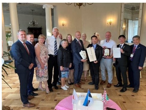
During the official visit marking the 5th anniversary of the sister-city partnership

S aku City in Nagano Prefecture and Saku, a town along the distant Baltic coast in Estonia — Their connection began with the mere coincidence of sharing the same name. Over the past 25 years, it has blossomed into citizen exchanges in culture, sports, and education, evolving into a host town role for the Tokyo Olympics and even the awarding of decorations. This story of friendship, built across great distance, is now expanding from the local level to the global stage.