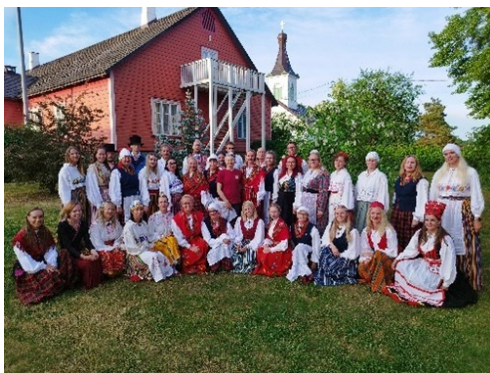
Türi Mixed Choir from Saku City, Republic of Estonia