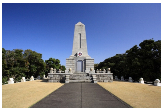
Memorial Monument for the Martyrs of the Ertuğrul Frigate in Kushimoto Town, Wakayama Prefecture

W akayama Prefecture and the Republic of Türkiye have built a deep friendship through historical events. During the 1890 shipwreck of the Ertuğrul Frigate off the coast of Wakayama Prefecture, local residents carried out dedicated rescue efforts. Furthermore, Turkish Airlines prioritized the evacuation of Japanese nationals during the 1985 Iran-Iraq War, an act also regarded as a symbol of friendship between the two countries. In 2025, the Governor of Wakayama Prefecture and the Mayor of Kushimoto Town visited Türkiye and signed a memorandum of understanding aimed at promoting youth exchanges to foster disaster prevention and cultural understanding. These initiatives are expected to further strengthen the relationship between Wakayama Prefecture and the Republic of Türkiye.