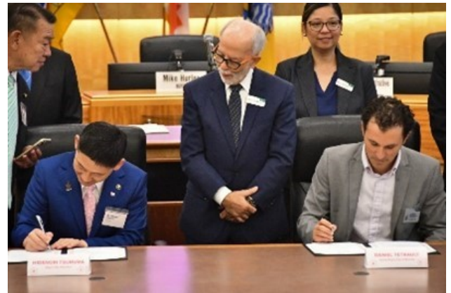
Renewal of Sister City Agreement held at Burnaby City Council Chamber