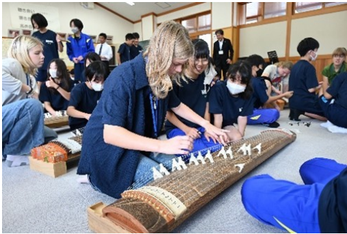
Children's exchange activities