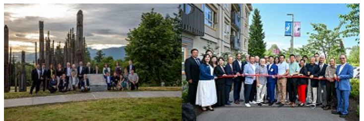
(Left) Alongside the Kamui Mintara Sculpture Park (Right) The opening ceremony for “Kushiro Lane”