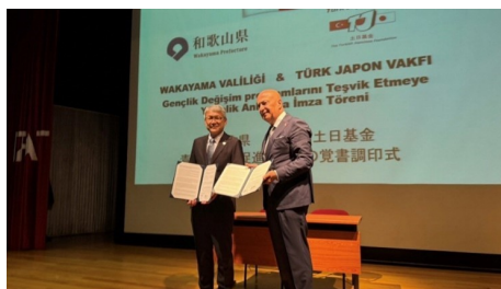
Signing Ceremony for the Memorandum of Understanding with the Turkish-Japanese Foundation Culture Center for Youth Exchange