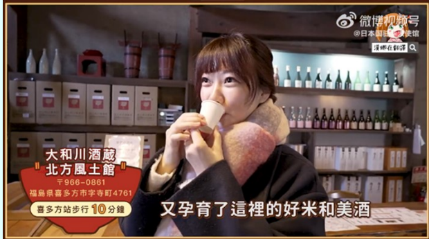
Scene from a video stream by Kitakata City, Fukushima Prefecture