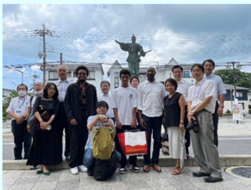
Commemorative photo with Minister Matheus Magala and his delegation (in front of JR Azuchi Station with a statue of Oda Nobunaga in the background)