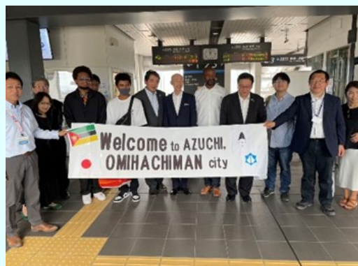
Commemorative photo with Minister Matheus Magala and his delegation (welcome ceremony at JR Azuchi Station)