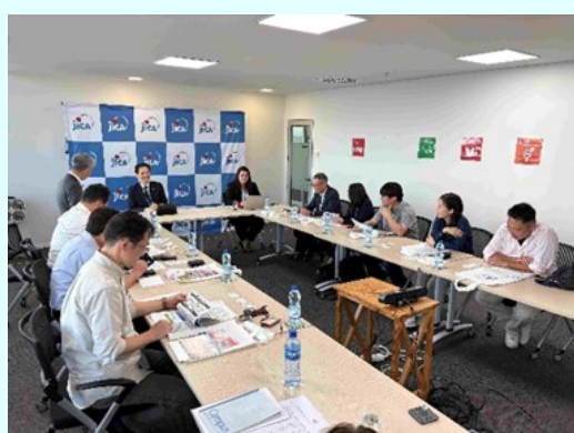
Visit to the JICA Mozambique Office and exchange of information

The former castle town of Oda Nobunaga and Mozambique's mysterious historical ties have developed into today's international exchange. Taking advantage of a visit to Japan by the Minister of Transport and Communications of Mozambique, a delegation from Omiachiman crossed the sea to begin exchanges. Cooperation is being explored in various fields such as agriculture, education, and tourism, and public-private partnership initiatives are underway with a view to linking up with the 2025 Osaka-Kansai Expo.