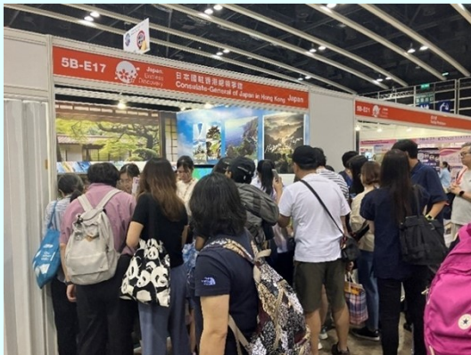
Visitors at the Japanese Consulate General's booth

From July 2024 to March 2025, the Ministry of Foreign Affairs of Japan, the Embassy of Japan in China, and the Consulate-General of Japan in Hong Kong held the “Local Promotion Project Abroad” in close collaboration with Japanese local governments, organizations and private companies. The aim of this project was to showcase the diverse attractions of regions in Japan, including tourism, culture, and cuisine. The project was designed to allow local consumers in China and Hong Kong to experience the attractiveness of Japanese regions and to promote sales and boost exports of Japanese food and products.