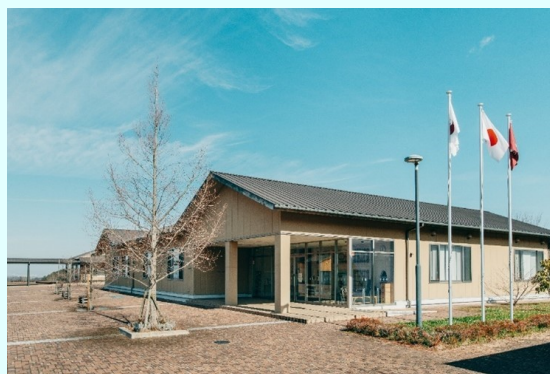
The NAFIC Food Creative Department (Abe Building) is located on a hill overlooking the Yamato Plain