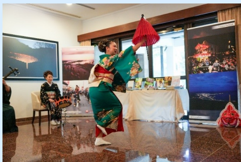
Performance of "TEODORI", the local folk arts of Aomori