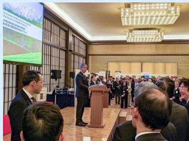
Opening remarks by Foreign Minister IWAYA

“Set among beautiful mountains and clear waters ~The Mountain Highland Resort NAGANO~”