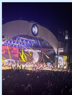
Opening ceremony of the 65th Cosquin Folklore Festival

O n March 18, the Minister for Foreign Affairs and the Governor of Nagano Prefecture co-hosted a reception “Set among beautiful mountains and clear waters ~The Mountain Highland Resort NAGANO~” at the Iikura Guest House, attended by approximately 210 people, including diplomatic corps to Japan. The reception featured booths introducing tourism, food, traditional crafts, and initiatives for promoting long and healthy lives of Nagano Prefecture, as well as demonstrations of Togakushi buckwheat noodles making and Togakure-ryu Ninja show on stage to promote diverse charms of Nagano Prefecture.