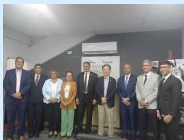
With Mayor Cardinale and other Cosquin officials at the music festival venue