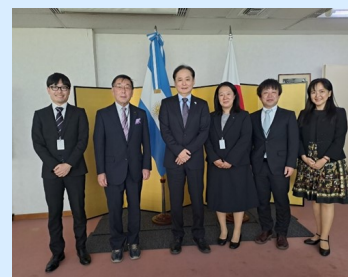
Kawamata Town delegation visit to the Japanese Embassy in Argentina

K awamata Town in Fukushima Prefecture and Cosquin City in Argentina became sister cities in 2024. What brought these two municipalities, which at first glance seem very far apart, together was the history of emigration and “folklore music”. Japanese musicians took part in the leading music festival in Latin America, and there was even a scene where all the audience members bowed and said “arigato”. This article introduces the deepening friendship and cultural exchange that is being built up in the lead-up to the 140th anniversary of Japanese emigration in 2026.