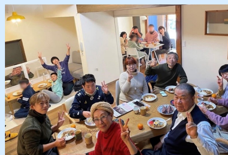
Enjoying lunch time at the center