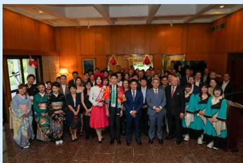
Group photo after the reception

A omori Prefecture co-hosted "Aomori Food and Tourism Reception" on December 11 with the Embassy of Japan in Singapore. The event aimed to boost exports of Aomori's agricultural, forestry, and fishery products to the Southeast Asian market. In addition to agricultural, forestry, and fishery products such as apples, rice, and tuna, Aomori's food and tourism attractions were introduced, including the Nebuta Festival in summer and Hakkoda in winter.