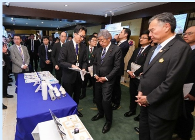
Foreign Minister IWAYA visited a booth of the SDGs initiatives with Governor ABE of Nagano Prefecture