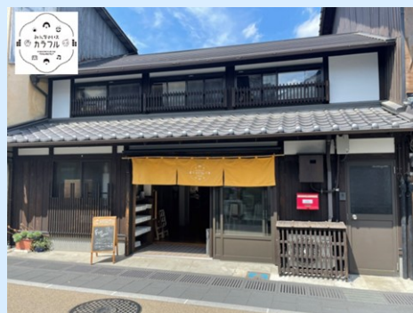
A multi-generational exchange center "Minna no Ie Colorful", which means "colorful home for everybody"