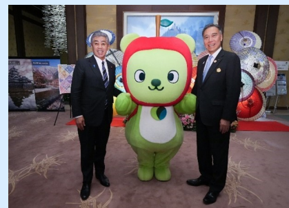
Photo with Nagano Prefecture PR character ARUKUMA

O n March 18, the Minister for Foreign Affairs and the Governor of Nagano Prefecture co-hosted a reception “Set among beautiful mountains and clear waters ~The Mountain Highland Resort NAGANO~” at the Iikura Guest House, attended by approximately 210 people, including diplomatic corps to Japan. The reception featured booths introducing tourism, food, traditional crafts, and initiatives for promoting long and healthy lives of Nagano Prefecture, as well as demonstrations of Togakushi buckwheat noodles making and Togakure-ryu Ninja show on stage to promote diverse charms of Nagano Prefecture.