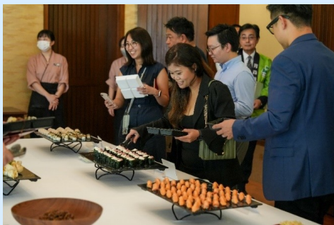
Tasting the food menu produced in Aomori