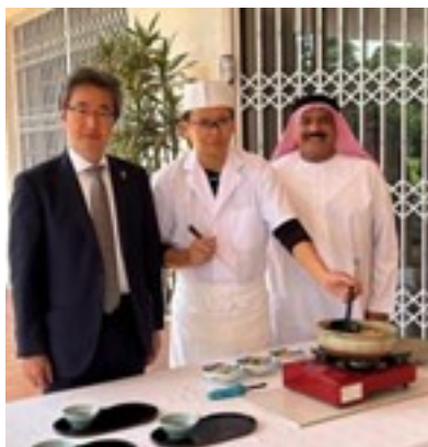
Author, Official Residence Chef, Presidential Advisor