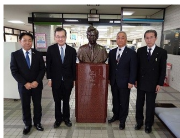
Photo with Inawashiro Town Executives