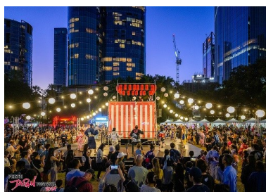
Participants dancing on the Yagura stage at the 10th Perth Japan Festival