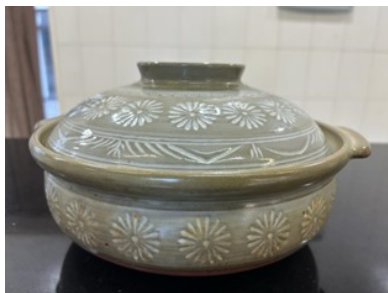
Banko-yaki (earthenware pots)