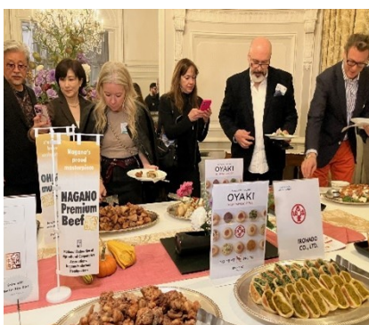
Original menu by the official residence chef

On October 29, the Consulate General of Japan in New York co-hosted a reception with the Nagano Prefecture on the theme of “Fermentation and Longevity: The Food of Nagano”. The United States is the largest export destination for processed foods from Nagano Prefecture. The reception was attended by 81 guests, including local importers, retailers, restaurant owners and members of the media. From Nagano Prefecture, Governor Abe and 10 local food manufacturers visited New York to promote the prefecture's attractions. This article provides an overview of the event.