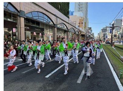
Both mayors dancing the Ohara-bushi at the Ohara Festival

Kagoshima City and Perth, Western Australia, began their exchange due to their geographical locations approximately at 32 degrees latitude north and south, respectively. In 2024, they celebrated the 50th anniversary of their sister city relationship. This article introduces the Perth Japan Festival and the visits of both mayors to each other's cities.