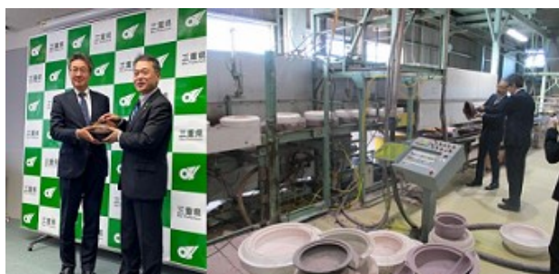
Meeting with the Governor of Mie Prefecture and a tour of the earthenware pot manufacturing site