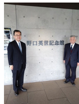
At Noguchi Memorial Hall