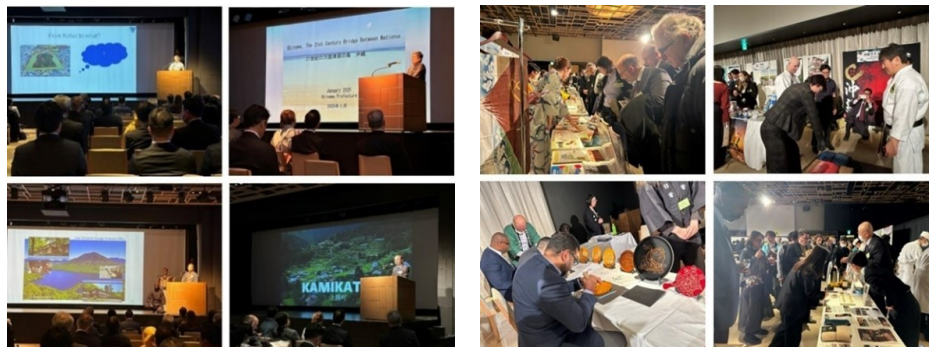
Presentation by local governments (From top left, Sakai city, Okinawa Prefecture, Nikko City, and Kamikatsu town)