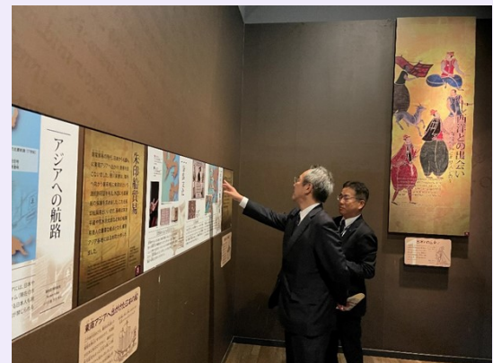
Visit to Nagasaki Museum of History and Culture

The year 2023 marked the 480th anniversary of relations between Japan and Portugal. These two countries conducted active exchanges such as the visit by Governor Oishi of Nagasaki Prefecture to Porto City in June, the visit by Mayor Moreira of Porto City to Nagasaki City in October, and the visit by Ambassador Ota of the Embassy of Japan in Portugal to the Omura City and Nagasaki City in December.