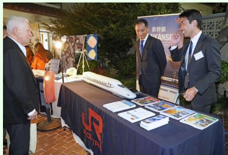
Booths promoting Nagoya City