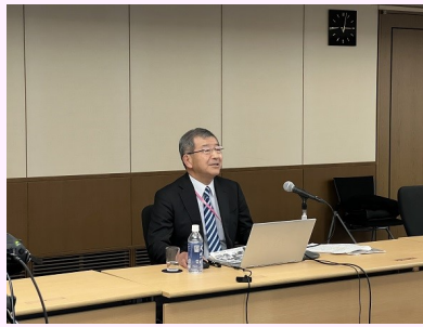
Lecture by the Society for Promotion of Japanese Diplomacy