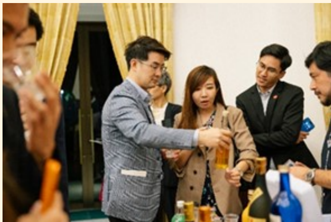
Participants enjoying tasting sake

On November 14, 2023, an event to promote Okinawa Awamori, Orion Beer, and tourism in Okinawa was held at the Residence of the Ambassador of Japan in Thailand. The event provided an opportunity to expand recognition and exports of alcoholic beverages from Okinawa, such as Awamori and Orion Beer in Thailand and to promote the tourism attractiveness of Okinawa. Over 100 people including liquor importers and wholesalers, food importers, retailers, restaurants owners, airline and travel businesses, media relations and influencers participated in this event.