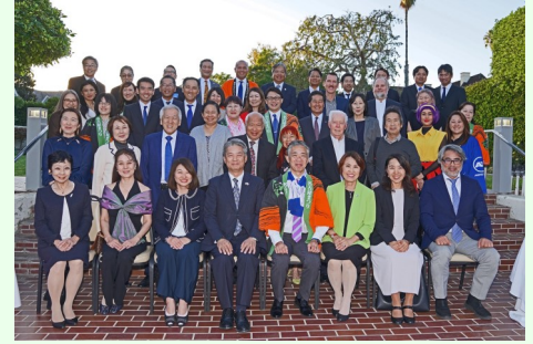
Group photo with participants of the event

In 2024, Nagoya and Los Angeles celebrate the 65th anniversary of their Sister City partnership. As part of efforts to mark the 65th anniversary, in November 2023, “Explore Nagoya and Central Japan,” event to promote inbound tourism in Nagoya for the related people of US tourism industry was held at the Residence of the Consul General of Japan in Los Angeles.