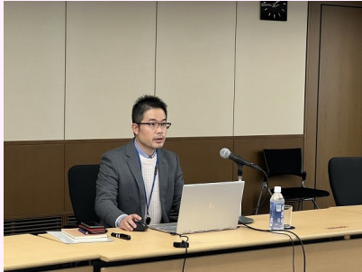
Lecture by Economic Policy Division, Economic Affairs Bureau of MOFA