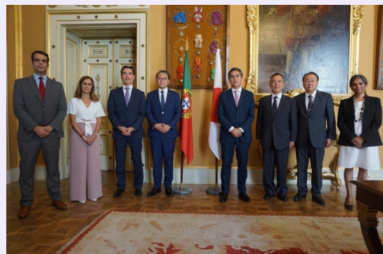
Visit to Porto City by Governor Oishi of Nagasaki Prefecture