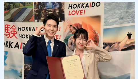
Appointment ceremony for “Hokkaido Cheer Network Smile Ambassador”