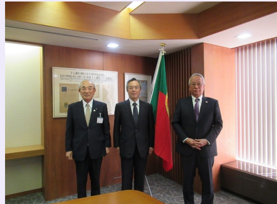
Visit to Honorary Consulate of Portugal in Nagasaki