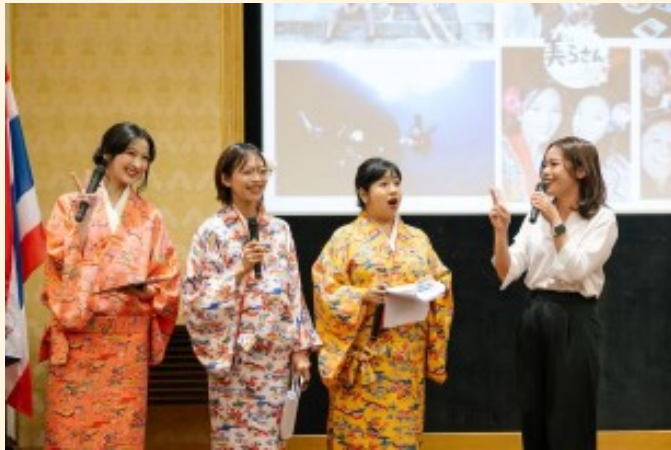
Talk Session on Tourism in Okinawa