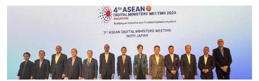
Mr. WATANABE Koichi, in the center, State Minister for Internal Affairs and Communications ^{f f \otimes}