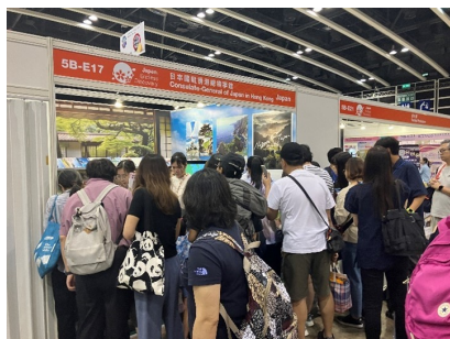
Visitors at the Consulate-General's booth