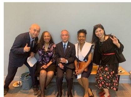
Graduates from a high school in Portland that had an exchange with a high school in Sapporo also participated