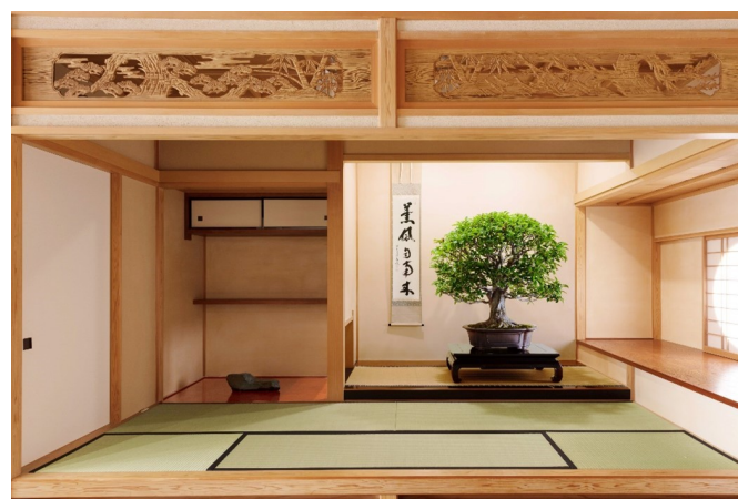
Zashiki decoration at the Omiya Bonsai Art Museum