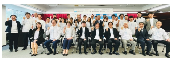
Kick-off event of "Kosen Open Innovation - Challenges from Africa 2024 -"