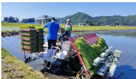
Agricultural workers from Madagascar experiencing rice planting with a rice planting machine