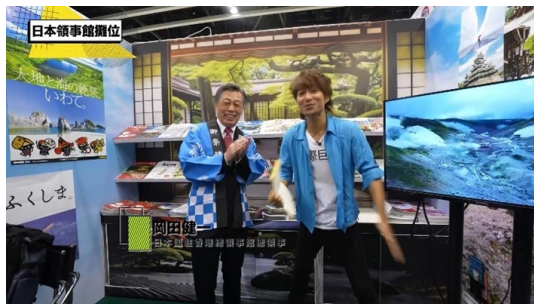
The shooting of promotional video