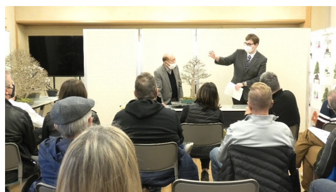
A bonsai class for foreigners