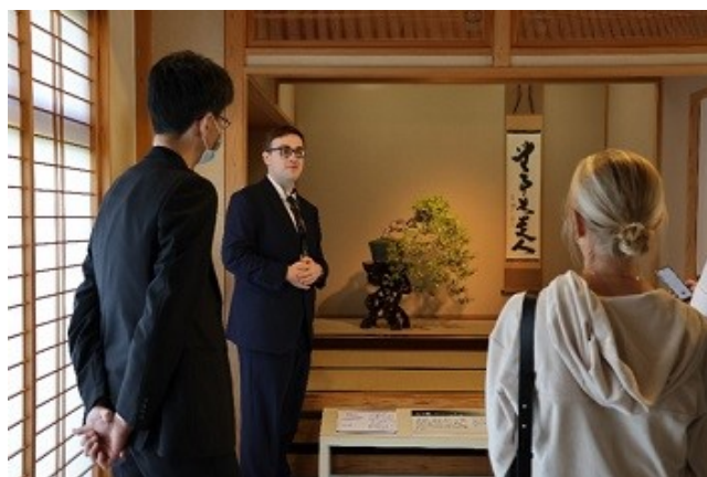
The author (center) explains bonsai to museum visitors