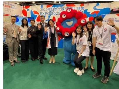
PR by Minister Jimi

In July 2024, as a part of "Local Promotion Project Abroad," the Consulate-General of Japan in Hong Kong, on the occasion of the 34th Hong Kong Book Fair, conducted PR activities for areas subject to food import restrictions, etc., as well as areas affected by the Noto Peninsula Earthquake. This article introduces the PR activities at the Consulate-General's booth in collaboration with local governments.