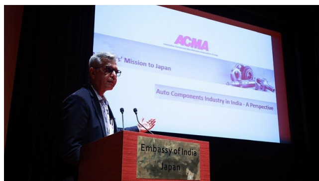
Presentation by the Indian Auto Parts Industries Association