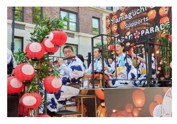
Performance by the Yamaguchi Gion Bayashi Preservation Society

n May 2024, the 3rd Japan Parade was held in New York. Yamaguchi City became the first Japanese local government to participate in the parade, after Yamaguchi City was featured in the New York Times' list of "52 Places to Go in 2024." The parade of Yamaguchi City has broadened New Yorkers' interest in Japan and has been noted as a good practice for attracting inbound demand to regional cities, which is significant from the perspective of promoting regional cooperation.