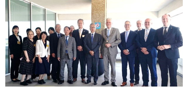
Group photo with people involved in sister city exchanges in both cities

n June 2024, a reception was held to commemorate the 35th anniversary of the sister city relationship between Tilburg, a core city in the southern part of the Netherlands, and Minamiashigara City in Kanagawa Prefecture. In response to recent recycle-based society and energy issues, Tilburg City, whose interest in Japan is gradually growing, has been actively collaborating with Japanese companies. Under these circumstances, it was a very useful opportunity to hold the reception to commemorate the sister city exchange between Japanese and Dutch local governments with officials from both sides, promoting the relationship between the two cities.