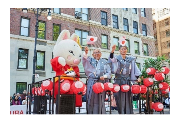
The Mayor of Yamaguchi City waving to the crowd