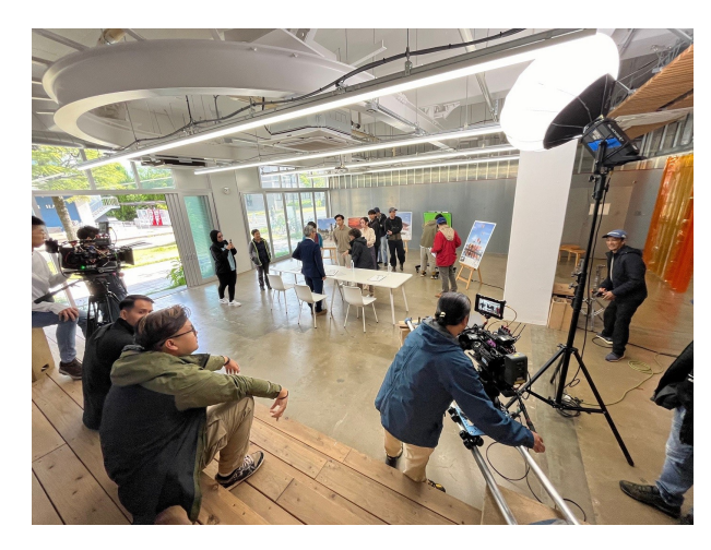
Filming of the drama at Saga University

aga Prefecture Film Commission is working to invite the location shooting of domestic and international productions to raise awareness of Saga Prefecture and promote tourism by publicizing information about the prefecture through visual images. This article presents how to attract the Malaysian drama "From Saga, With Love," which was a huge hit in Southeast Asia, the promotion of its appeal, and the response it received.