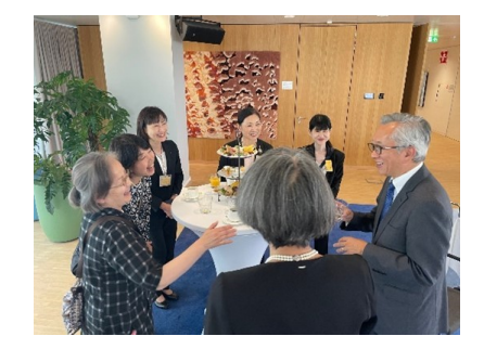
Exchange with Minamiashigara City officials