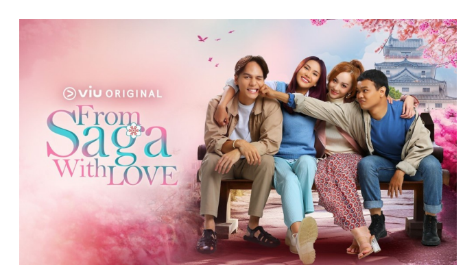
Malaysian Drama "From Saga, With Love"