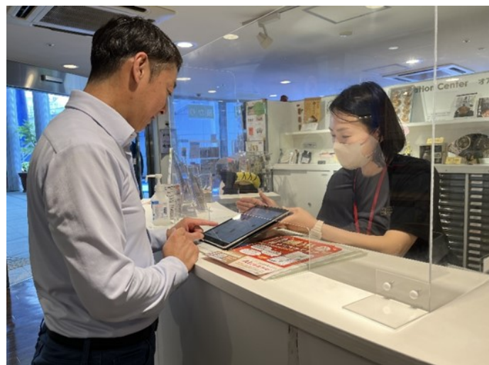
A visitor receiving instructions on how to use the digital map