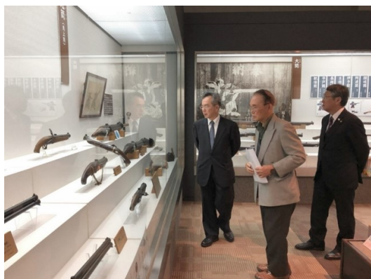
Visit to the Tanegashima Development Center "Teppokan"