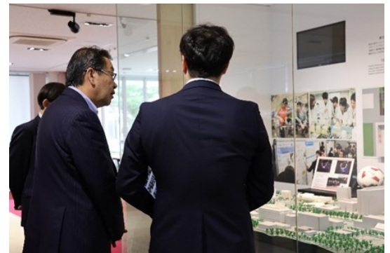
At School of Engineering, Tohoku University