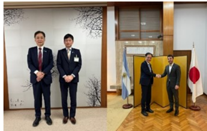
Left: Meeting with Mayor NAKAGAWA of Joetsu City Right: Meeting with Governor Torres of Chubut Province