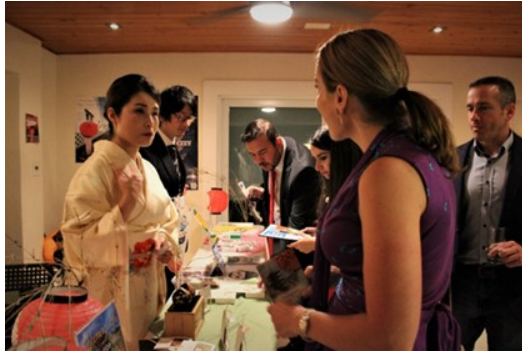
Invited guests listening to explanations at the PR booth of Yamaguchi City

It may be fresh in your memory that Yamaguchi City was featured in the New York Times' list of 52 Places to Go in 2024. In February, at the reception celebrating the birthday of His Majesty the Emperor held at the residence of the Consulate-General of Japan in Miami, the PR activity was carried out to promote the attractions of the prefecture and the city. This article informs you about the details of the reception.