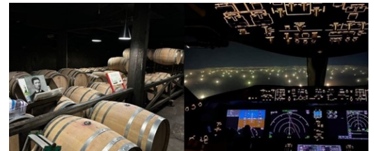
Left: Iwanohara Vineyard in Joetsu City (Since 1890) Right: Visiting a fishing boat operating in the waters near Argentina