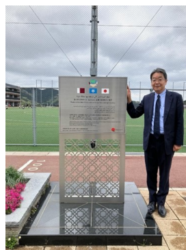
Appreciation plaque for Qatar inside Onagawa Elementary and Junior High School