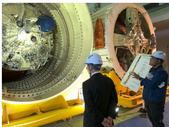
Visit to the Tanegashima Space Center