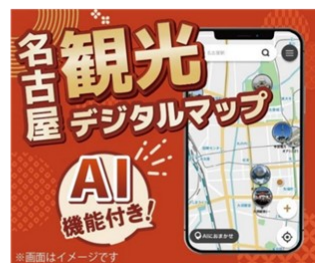
The QR code and banner of the digital map