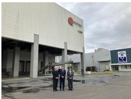
The "MASKAR" (freezing and refrigeration facility), a symbol of Onagawa's reconstruction