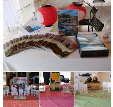
Brochures and promotional items at the PR booth of Yamaguchi City