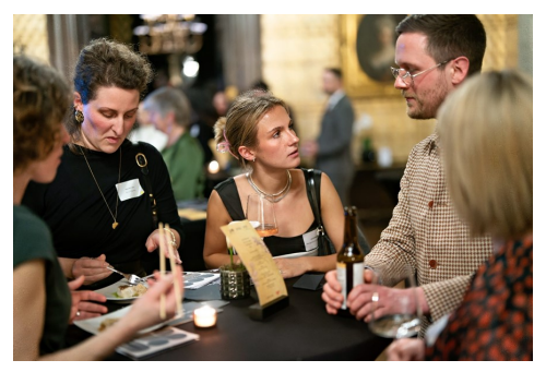
Guests enjoying Japanese seafood and sake