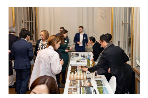
Many German guests showed interest in the various municipal booths