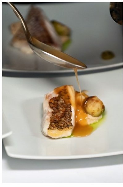
Meuniere of Japanese sea bream that was well received for its thickness

n March 4, the Embassy of Japan in Germany, together with JETRO and JNTO, hosted "Japan Night Food & Travel," a reception to promote the appeal of Japanese food and inbound tourism in Germany. This reception, by simultaneously promoting food and tourism, aimed to synergistically expand exports of Japanese agricultural, forestry, and marine products and food products and inbound tourism.