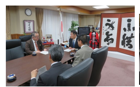
Meeting with the Governor of Yamanashi Prefecture