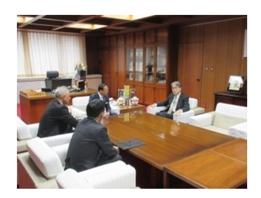
Meeting with Mayor Ikeda of Miyakonojo City