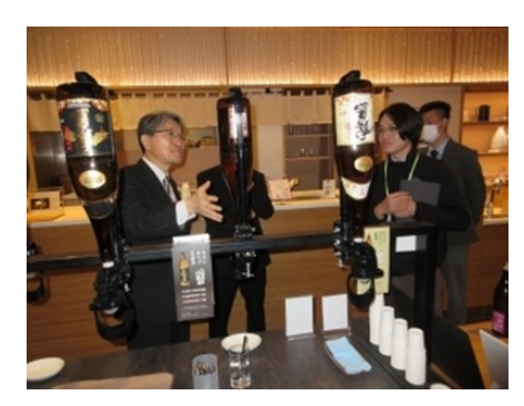
Visit to a sake brewery, Kirishima Shuzo