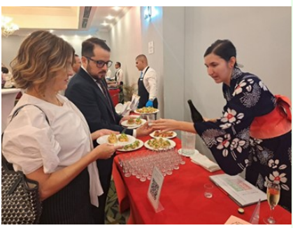
Sake booth at the promotional reception of Japanese food

he five Central American countries, including Japan and Costa Rica, will celebrate the 90th anniversary of the establishment of diplomatic relations in Feb 2025, during which time sister city ties have been established between Costa Rica and Okayama City in Okayama Prefecture and Kesennuma City in Miyagi Prefecture. In addition to these, Matsukawa Town in Nagano Prefecture became a host town for the Tokyo 2020 Olympic and Paralympic Games, and the abovementioned municipalities were promoted at the Emperor's Birthday Reception held recently at the Embassy of Japan in Costa Rica. The Embassy also held a Japanese food promotion event with Costa Rican Japanese restaurants, where Niigata's sake was introduced.