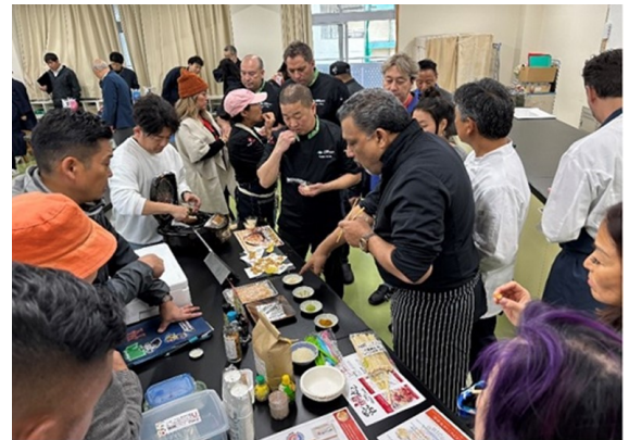
Exchange with fishers At Uwajima Fisheries High School