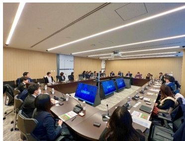
Scenes from the lecture