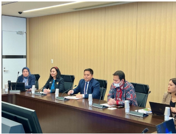
Indonesian Embassy staff welcoming the participants of MOFA