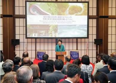
Opening remarks by Foreign Minister Kamikawa

Reception co-hosted by the Minister for Foreign Affairs of Japan and the Governor of Tokushima Prefecture “TOKUSHIMA and its progressive initiatives toward the achievement of the SDGs”