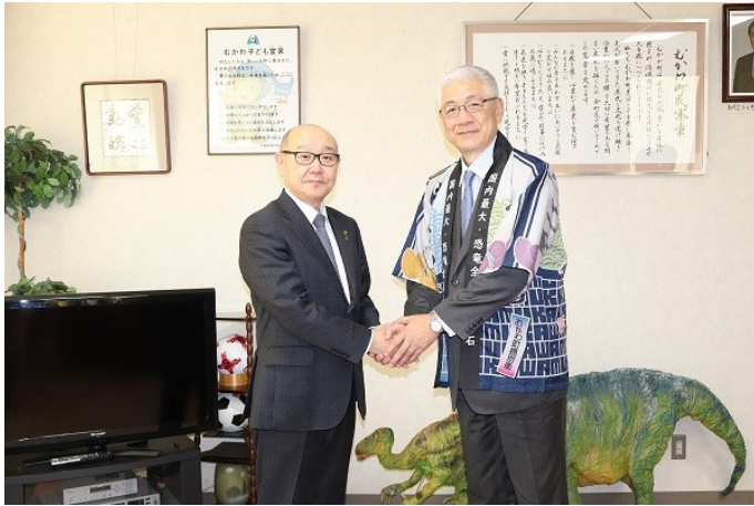
Mayor Takenaka and Ambassador Ozaki