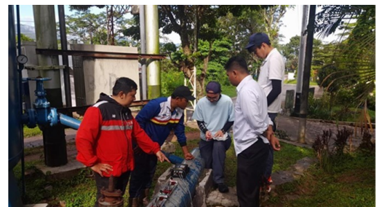
Bidadari water distribution reservoir : Water supply measurement of Damar water distribution reservoir

In January 2024, Consul-General Takonai of Japan in Medan visited Toyohashi City, Aichi Prefecture. He called on Mayor Asai and exchanged views with officials of the Water and Sewerage Department, and visited the Odakano Water Treatment Plant. Toyohashi City has been cooperating with Solok City, West Sumatra for more than 10 years in the field of water supply and sewerage technology. Thanks to this cooperation, Solok City has been able to supply drinkable tap water for the first time in Indonesia.