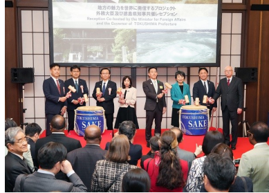
Ceremonial opening of sake barrels