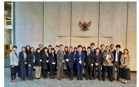
Group photo in front of the Embassy of Indonesia in Japan

On February 7, officials who are from local governments currently working at MOFA visited the Embassy of Indonesia in Japan. They took lectures about Indonesia, the bilateral relationship between Japan and Indonesia, as well as exchanges between local areas of two countries, which was a meaningful program for these officials.