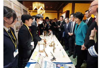
Foreign Minister Kamikawa visited a booth of the SDGs initiatives by High School students with Governor Gotoda of Tokushima Prefecture

On March 13, a reception co-hosted by Foreign Minister Kamikawa and Governor Gotoda of Tokushima Prefecture was held at Iikura House, inviting diplomatic corps to Japan and other guests. The reception featured booths introducing Tokushima Prefecture's food, Host Town exchange, SDGs initiatives by companies and high school students, tourism, traditional crafts as well as the "Awa Odori", traditional dance performance of Tokushima etc. to promote the diverse attractions of Tokushima Prefecture.