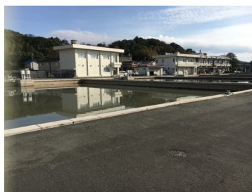
Odakano water treatment plant