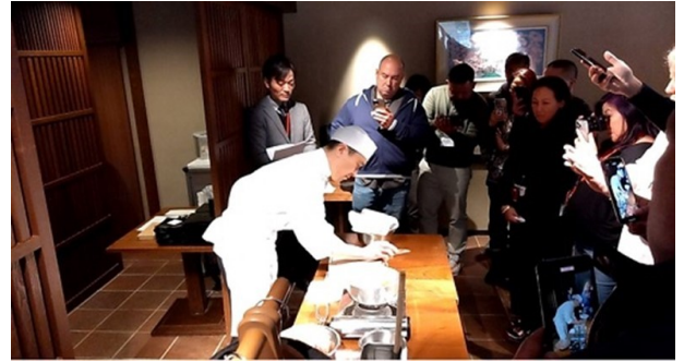
Lecture of the broth by the head chef of "Kayanoya" restaurant