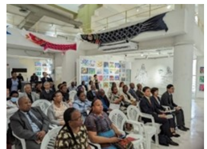
Opening ceremony of the Children's Art Exhibition (Botswana National Museum)

A n exchange through art paintings by elementary school students between Tsuzuki Ward, Yokohama City and Botswana had begun with the 4th African Development Conference (TICAD IV) held in Yokohama in 2008. An online interaction of children in Tsuzuki ward and Botswana, and Children's Art Paintings Exchange Exhibition were held to commemorate the 10th anniversary of this exchange.