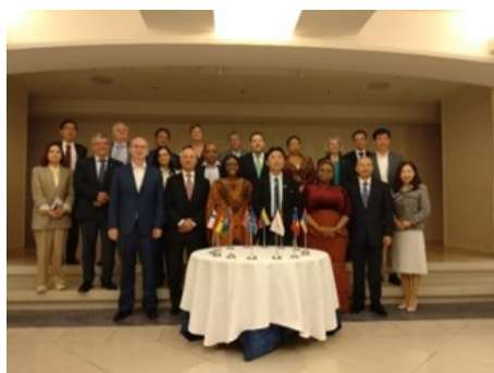
Welcome dinner hosted by the Governor of Tokushima Prefecture