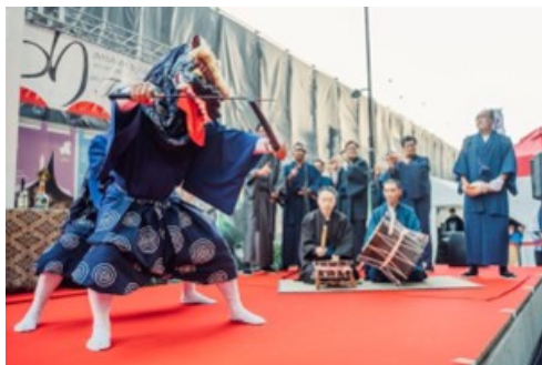
Kagura Dance of Yakoshi district by Sai Village, Aomori Prefecture

O n October 29, 2023, "Festival of The Most Beautiful Villages in Japan 2023" was held at TOKYO TORCH PARK nearby Tokyo Station, by the NPO "The Most Beautiful Village in Japan" Coalition. Japanese regional culture and traditions, local products were introduced to participants.