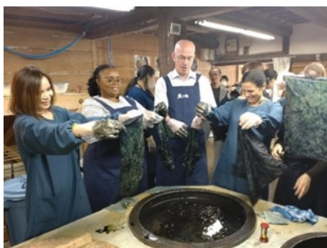
Experience indigo dyeing