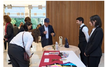
Local products of Harima area exhibited at the reception

O n October 2023, a reception was held at the residence of Ambassador of Japan to France, to promote local food and products of Harima area, Hyogo Prefecture, as well as local sake designated as "Geographical Indication (GI) Harima".