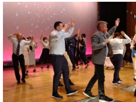
Experience Awa Odori

O n October 30 and 31, 2023, the Ministry of Foreign Affairs of Japan conducted Diplomats' Study Tour together with Tokushima Prefecture with the participation of 16 ambassadors and others from 12 countries. Participants visited facilities related to Tokushima Prefecture's history, culture, and industry, and exchanged views with people concerned under the theme of "History of Tokushima Prefecture and progressive efforts conducted by Tokushima Prefecture to achieve SDGs".