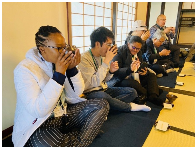
Experience Japanese tea ceremony at the Tea Museum, Shizuoka