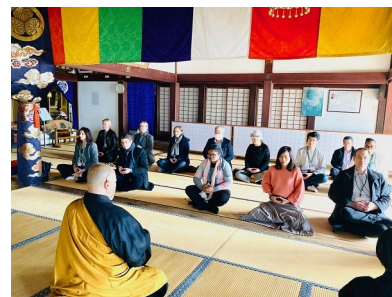
Experience Zazen meditation at Kasuisai Temple

O n November 28 and 29, 2023, the Ministry of Foreign Affairs of Japan conducted Diplomat's Study Tour together with Shizuoka Prefecture with the participation of 14 ambassadors and others from 11 countries. Under the theme of "Exploring the cultural wonders and attractions of Shizuoka Prefecture", the participants expanded their knowledge of the diverse charms including its history, culture and arts, cuisine, and nature and manufacturing industries of Shizuoka Prefecture, which had been designated as the Culture City of East Asia 2023.