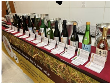
Sake of "GI Harima"