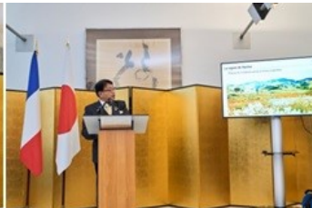
Mayor Kiyomoto of Himeji City promoting Harima area at the reception