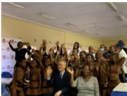
Ambassador of Japan to Botswana Setsuo Omori (center) participating in the online exchange