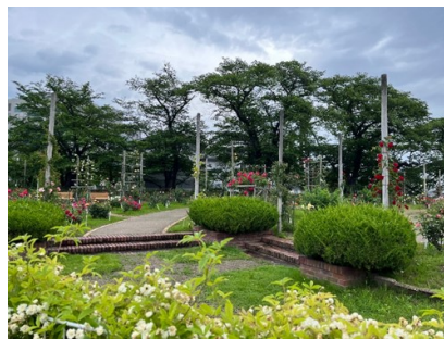
Rose garden in Kaiseizan Park