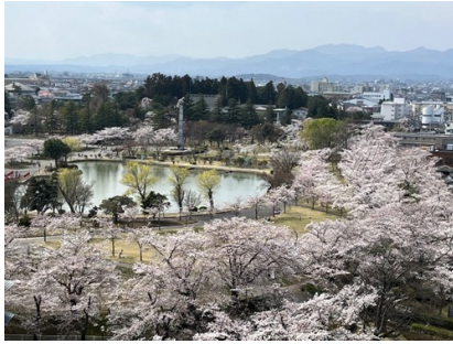
Cherry blossoms in full bloom at Kaiseizan Park