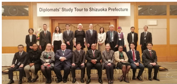
Welcome Dinner hosted by the Governor of Shizuoka Prefecture