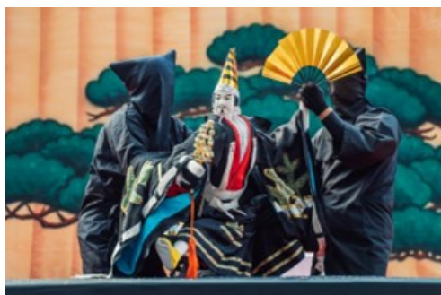
Nakagawa Ningyo Joruri (puppet show) by Nakagawa Village, Nagano Prefecture