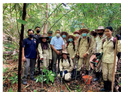
[Back Cover Photograph]