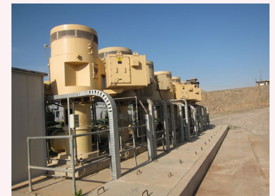
Iraq “Water Supply Improvement Project in Kurdistan Region” (Yen Loan)

A control tower, administration building, and utility facility constructed alongside the airport. By developing and expanding airport facilities, it became possible to meet the increasing demand for air transport.