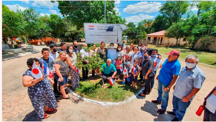
Paraguay “The Road Improvement Project in Repatriación” (Grant Assistance for Grass-Roots Human Security Project)

Local officials and stakeholders expressing their gratitude to Japan at the handover ceremony. The project made it possible for the local residents to use the road safely regardless of the weather.