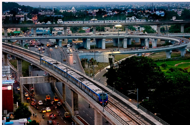
India “Chennai Metro Project” (Yen Loan)

Japan works to develop quality infrastructure that supports the lives and economic activities of people living in developing countries and serves as the foundation for their national development.