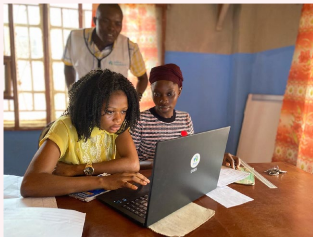
Sierra Leone "Electricity is back! Make it snappy while it's available!"