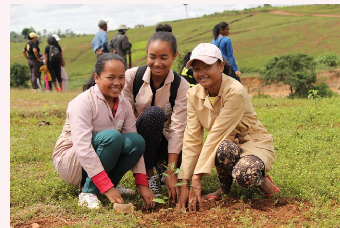
Madagascar "Tree of hope for tomorrow"