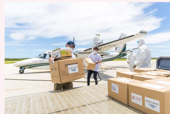
Tonga "From Japan to Tonga, with all our hearts"