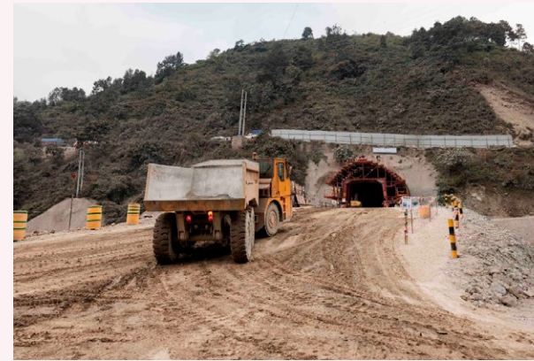
Nepal “Nagdhunga Tunnel Construction Project” (Yen Loan)

The Rades-La Goulette Bridge lit up on the occasion of TICAD 8. Connecting La Goulette on the north side of the Tunis Lake Canal with Rades on the south side serves to divert traffic that was concentrated in the central districts of Tunis.