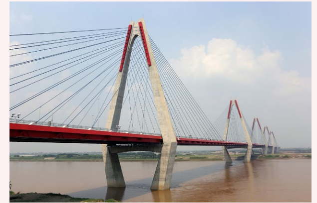
Viet Nam “Nhat Tan Bridge (Viet Nam-Japan Friendship Bridge) Construction Project” (Yen Loan)

Construction of a tunnel at the Nagdhunga Pass, which will serve as a gateway to the Kathmandu Metropolitan Area. It is expected to respond to the rapidly increasing traffic demand, reduce travel time, and enhance traffic safety.