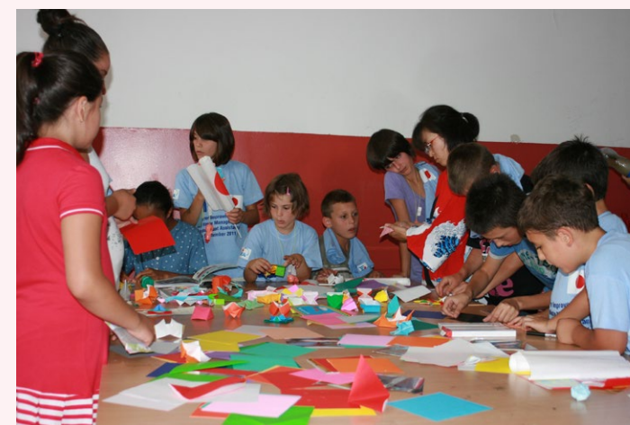
Kosovo "First origami experience"