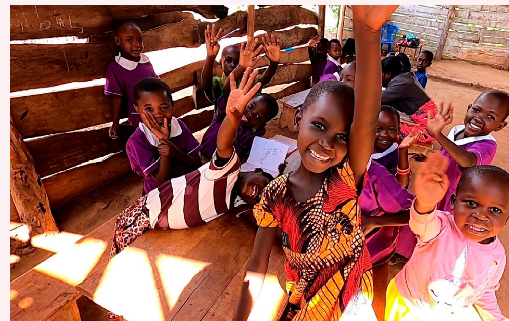
Uganda "Japan and Uganda - smiles connect us over 4,000 km"

This collection of photographs is from the "Global Festa JAPAN 2022" photo contest. (See page 149 for details.)