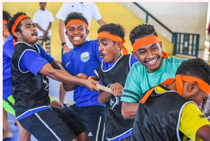
Timor-Leste "Tug of War"