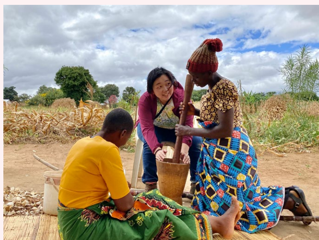
Malawi "Cooking together for children's nutrition"