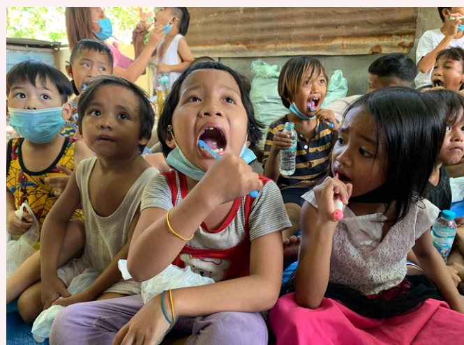
Philippines "First time brushing teeth"