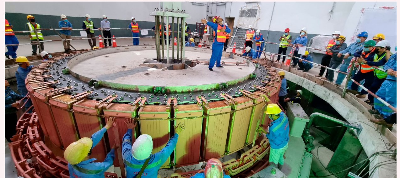
Laos “Nam Ngum 1 Hydropower Station Expansion Project” (Yen Loan)

Construction of the bridge for the improvement of logistics efficiency and the easing of traffic congestion.