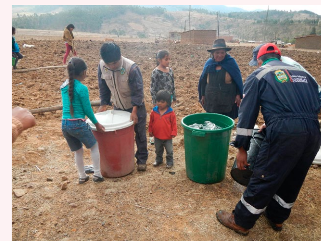
Bolivia "The well revived!!"