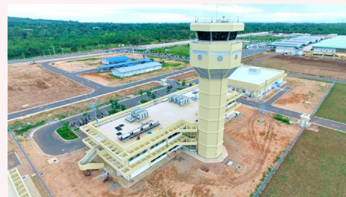
Philippines “New Bohol Airport Construction and Sustainable Environment Protection Project” (Yen Loan)

Installation of a power generator in the construction work of the Nam Ngum Dam, which increased the capacity of stable, sustainable, and efficient power supply to the Vientiane Metropolitan Area.