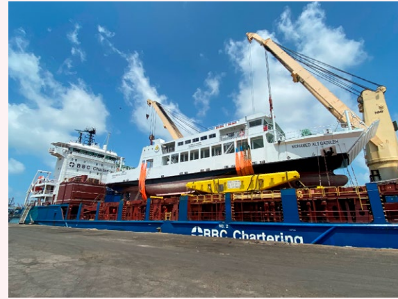
Djibouti “The Project for the Reinforcement of Maritime Transport Capacity at the Gulf of Tadjourah” (Grant Aid)

Local officials and stakeholders expressing their gratitude to Japan at the handover ceremony. The project made it possible for the local residents to use the road safely regardless of the weather.