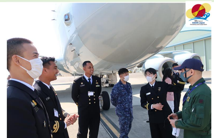
Japan-ASEAN Ship Rider Cooperation Program 5