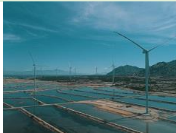
Construction of wind power plants in Vietnam