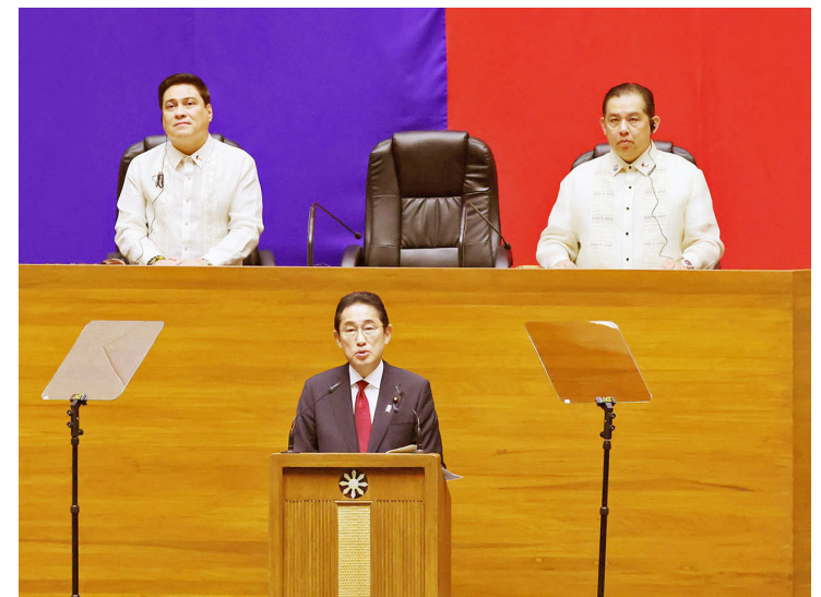
PM Kishida to address the Special Joint Session of the Philippine Congress