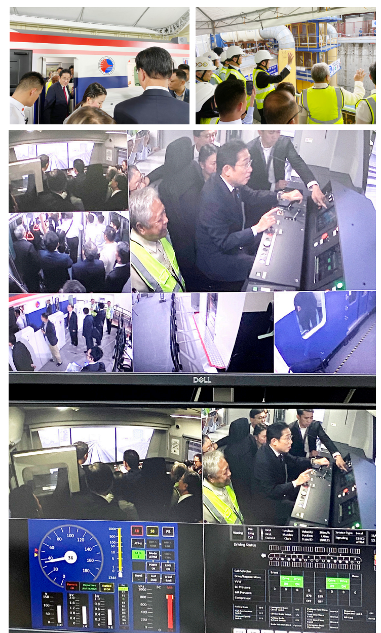
A 50-year Filipino Dream: PM Kishida explored the site of the Metro Manila Subway Project during his first official visit to the Philippines