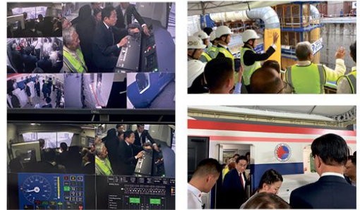
A 50-year Filipino Dream: PM Kishida explored the site of the Metro Manila Subway Project during his first official visit to the Philippines.

digitalization, and AI governance. I look forward to working more closely than ever with the people of ASEAN, based on strong "trust," to "co-create" a peaceful and stable world where everyone can live with dignity and also a sustainable and prosperous future.