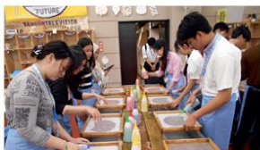
JENESYS 2023: Filipino High Schools students take part in JENESYS Program in Japan PHOTO CREDIT: JAPAN INTERNATIONAL COOPERATION CENTER (JICE), 2023