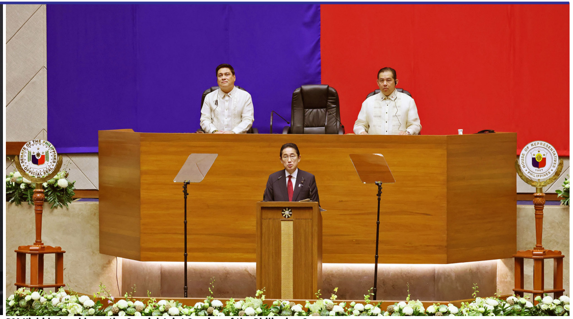
PM Kishida to address the Special Joint Session of the Philippine Congress