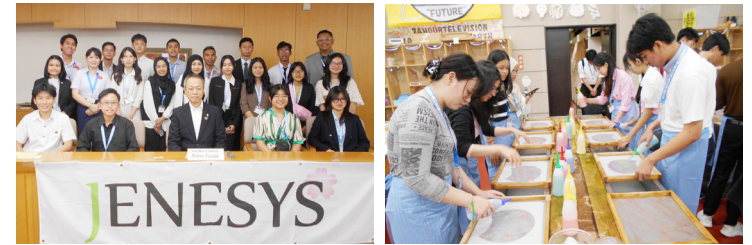
JENESYS 2023: Filipino High Schools Students take part in JENESYS Program in Japan