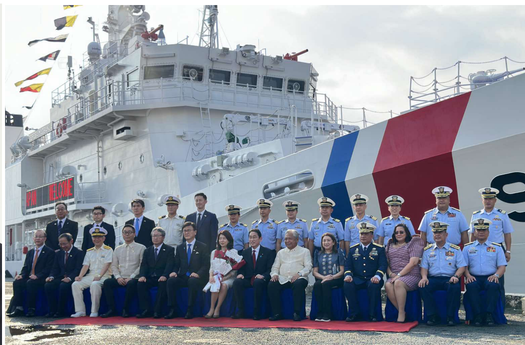
A SYMBOL OF JAPAN-PHILIPPINE COOPERATION: PM Kishida aboard Philippine Coast Guard flagship vessel provided by Japan