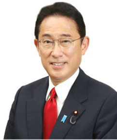
Prime Minister Fumio Kishida PHOTO CREDIT: PRIME MINISTER'S OFFICE OF JAPAN, 2023

For example, the Government of Japan has sponsored some 40,000 international students from ASEAN countries. The Sakura Science Program, which is a youth exchange program in the field of science and technology, has hosted about 15,000 students. The ASIA KAKEHASHI Project has hosted about 1,000 students. The total number of members of the ASEAN Council of Japan Alumni (ASCOJA), a council of alumni associations in ASEAN countries for former international students in Japan, now exceeds 50,000, making it a valuable network of friendship. Moreover, some 13,000 people have participated in the Ship for Southeast Asian and Japanese Youth Program (SSEAYP), and 47,000 people have participated in the JENESYS youth exchange program, fostering friendship. In addition, JICA has sent more than 8,000 Overseas Cooperation Volunteers to ASEAN countries, and the Japan Foundation has