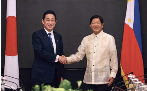
Japan-Philippine Summit Meeting

Japan-ASEAN relationships go beyond business. The foundation of Japan-ASEAN relations as true friends is a relationship of mutual trust with "heart-to-heart" connections. It has been nurtured over the years through "people-to-people" exchanges in a wide range of fields. Both the public and private sectors have continued to