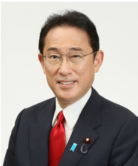
Prime Minister Fumio Kishida

(Prime Minister Kishida’s Contribution to Philippine Media On the Occasion of the Special Summit Meeting to Commemorate the 50th Anniversary of ASEAN-Japan Friendship and Cooperation)