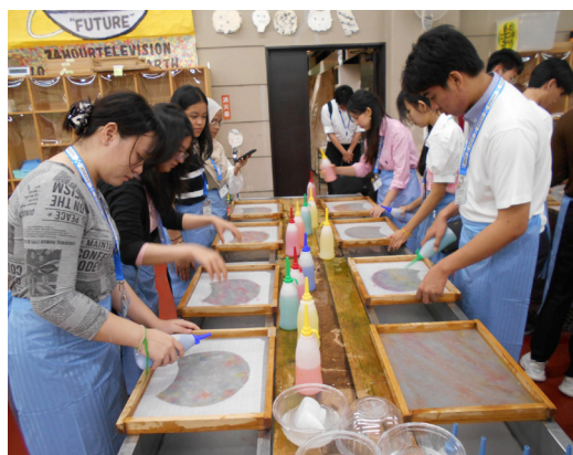
JENESYS 2023: Filipino High Schools Students take part in JENESYS Program in Japan