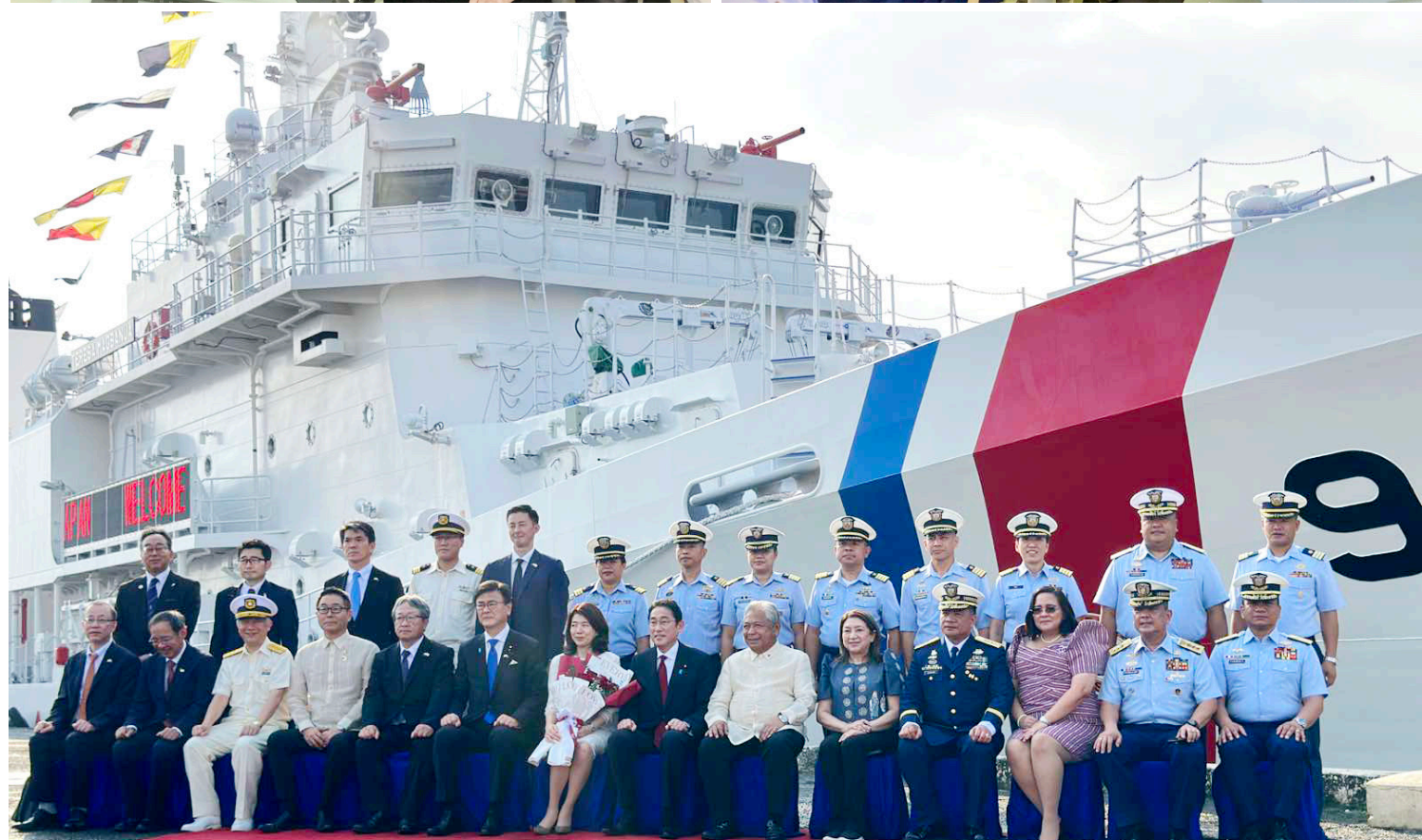
PM Kishida aboard Philippine Coast Guard Flagship vessel provided by Japan