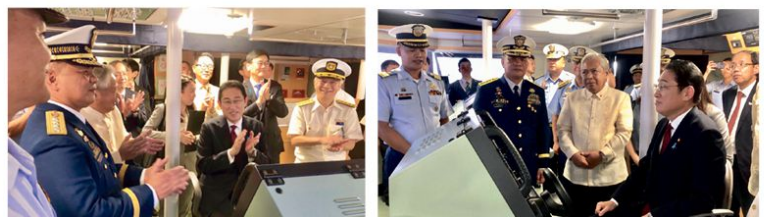
A symbol of Japan-Philippine Cooperation: PM Kishida aboard Philippine Coast Guard Flagship vessel provided by Japan