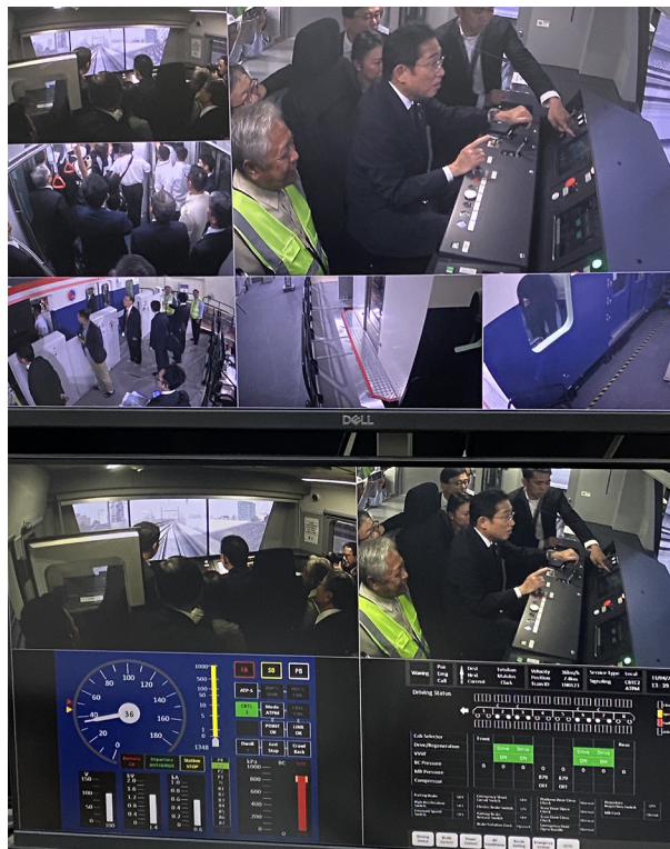
A 50-YEAR FILIPINO DREAM: PM Kishida explored the site of the Metro Manila Subway Project during his first official visit to the Philippines

In the half century Japan initiated dialogue with ASEAN in 1973, ahead of the rest of the world, Japan has walked alongside ASEAN, including the Philippines, on its path of development and integration. Japan has supported the development of the ASEAN region through development cooperation in various fields. Japan and ASEAN are each other's major trading partners, and Japan is the second largest direct investor in ASEAN after the United States. In recent years, Japanese direct investment in ASEAN has averaged about 2.8 trillion yen annually. Japanese companies have approximately 15,000 business establishments in ASEAN, bringing the vitality of the fast-growing ASEAN region into the Japanese economy and also creating products, services and employment in ASEAN countries, thus contributing to their economic development.