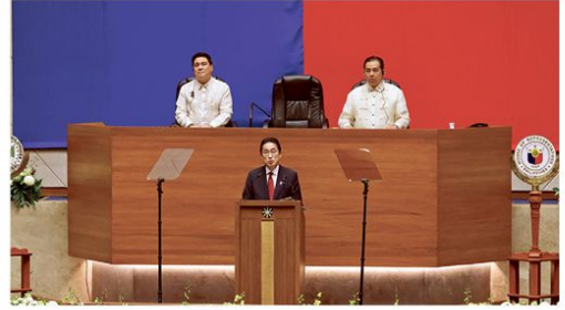
PM Kishida to address the Special Joint Session of the Philippine Congress

The international community is now at a turning point in history, and the free and open international order based on the rule of law is under serious challenge. We also face complex and compounding challenges such as climate change, inequality, public health crises,