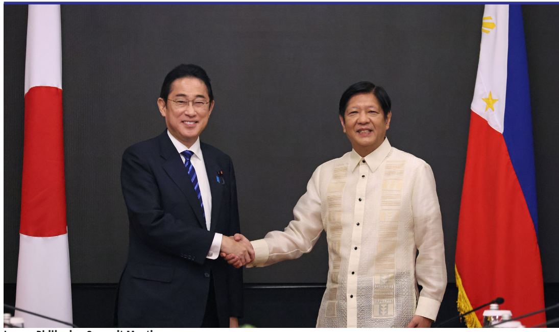
Japan-Philippine Summit Meeting