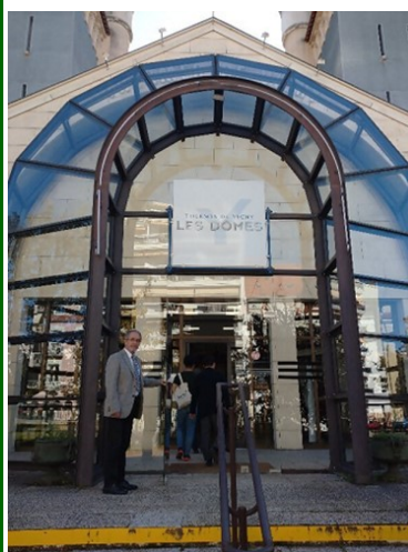
"Thermes les Dômes", thermal bath of Vichy