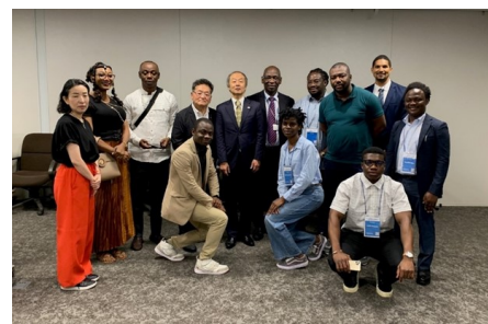
With people from Cote d'Ivoire living in the vicinity of Gifu City

In November 2023, Ambassador Ikkatai of Japan in Cote d'Ivoire visited with Mayor Ozeki of Seki City, Gifu Prefecture, and Mayor Shibashi of Gifu City respectively and exchanged views on the expansion of exchange between the two cities in Gifu Prefecture and Cote d'Ivoire.