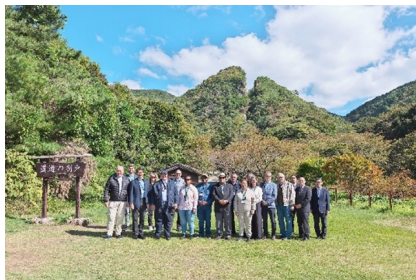
Group photo with "Doyu no Warito" of Sado Island Gold Mines site background