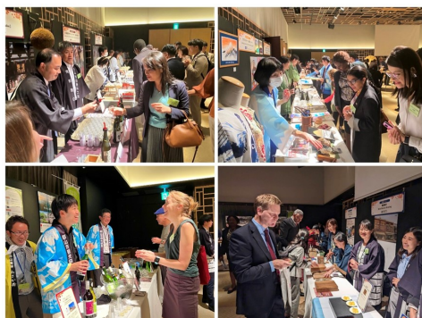
Participants at booths set by each local government (From top left, Nara Prefecture, Shizuoka Prefecture, Koriyama City and Ishioka City)