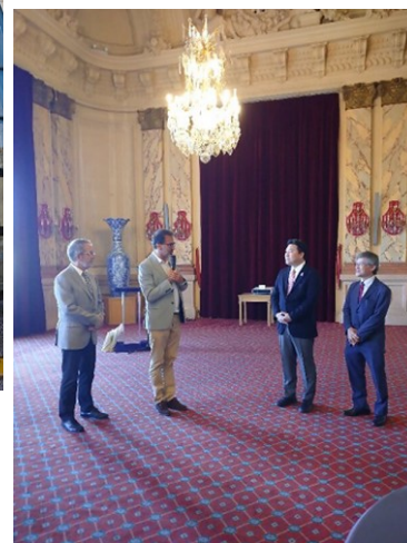
Meeting between mayor Nagano of Beppu City and mayor Aguilera of Vichy City

Beppu City, which is famous for its hot springs, is targeting the wellness tourism for the sustainable tourism city. Mayor of Beppu City visited Vichy City, also known as resort of hot springs, in order to learn activities of the city about wellness tourism. The two cities have begun to build their exchange through hot springs.