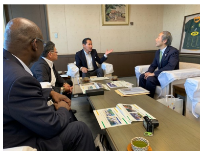
Meeting with Mayor Ozeki of Seki City