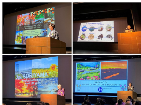
Presentation by each local government (From top left, Nara Prefecture, Shizuoka Prefecture, Koriyama City, and Ishioka City)