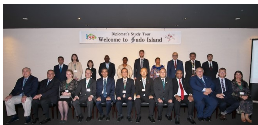
Group photo with Governor Hanazumi and Mayor Watanabe of Sado City