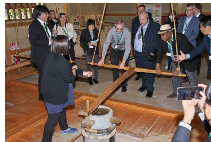
Experience of Gold smelting process at the former Sado Magistrate's Office

On October 12 and 13, the Ministry of Foreign Affairs of Japan conducted Diplomat's Study Tour together with Niigata Prefecture and Sado City with the participation of 13 ambassadors and others from 10 countries. The diplomatic corps visited the facilities to experience the cultural value and history of the Sado Island Gold Mines, which is being nominated for the inscription on the World Heritage List. Diverse regional attractions including Sado's culture and histories, its cuisine, traditional performing arts, nature, were promoted to the diplomats.