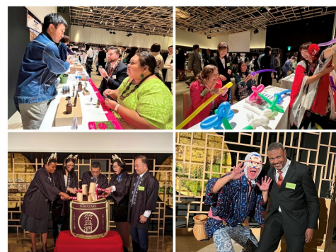
Participants interacting with local government officials at booths and stage performances (From top left, Ishioka City, Shizuoka Prefecture, Nara Prefecture and Koriyama City)

On October 19, the Ministry of Foreign Affairs hosted the Regional Promotion Seminar 2023 jointly with the local governments of Nara Prefecture, Shizuoka Prefecture, Koriyama City (Fukushima Prefecture) and Ishioka City (Ibaraki Prefecture) in Tokyo, and 120 participants including Ambassadors and other representatives attended. Each local government made a presentation to the participants on its local industry, tourism, local products, among others and introduced the various attractions of each region through booth displays and stage performances.