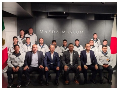
Governor Rodríguez's visit to Headquarter of Mazda