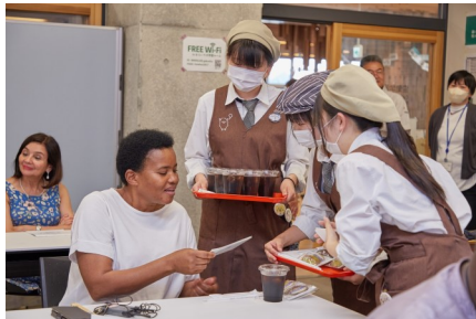
Exchange between the diplomats and students of Futaba Future School