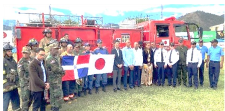
Donation and delivery of a fire truck with water tank to the Dominican Republic (Matsudo City, Chiba Prefecture)