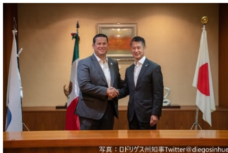
Governor Yuzaki of Hiroshima Prefecture and Governor Rodríguez of the State of Guanajuato