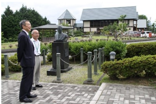
Visit to the park commemorating Mr. Sugihara Chiune