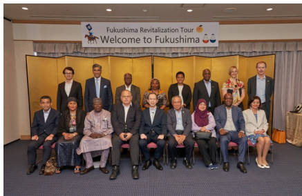
Group photo with Governor UCHIBORI