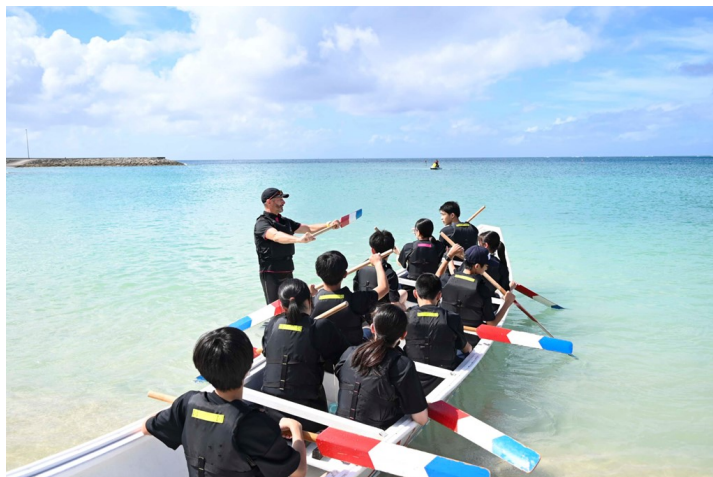
Teaching local children how to ride on the traditional boat "Harley"