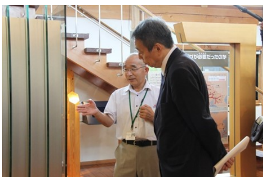
Visit to the Chiune Sugihara Memorial Hall