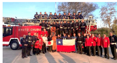
Donation of a truck with a ladder and training to the Republic of Chile (Kyoto Chubu Wide-area Office Association)