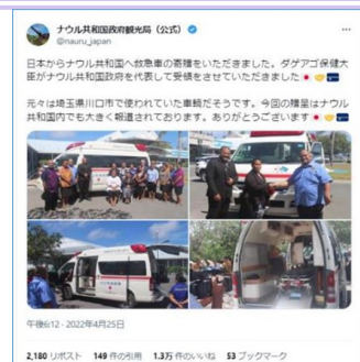
There was a great response on the official X (formerly Twitter) account of the Japan Office of the Republic of Nauru Tourism Bureau, and the event was covered by the local media.

The Society for Promotion of Japanese Diplomacy (SPJD) is involved in overseas aid projects, donating used fire engines and ambulances offered by Japanese local governments to developing countries through the scheme of the Ministry of Foreign Affairs' ODA "the Grant Assistance for Grass-Roots Human Security Projects". This article provides information on exchanges between Japanese local governments and those of overseas through the above cooperation.