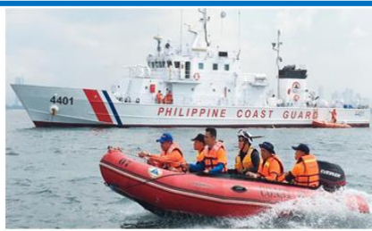
Philippines : Training using 44- meter-class patrol vessels provided by Japan