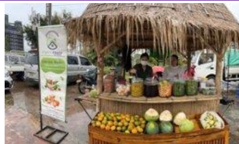
Laos: Organic vegetable juice stand started through a prior project