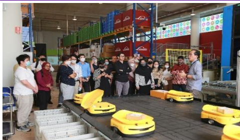
JSPP21: Supply Chain Resilience course