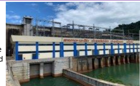
Laos: Expanded Nam Ngum 1 Hydropower Station