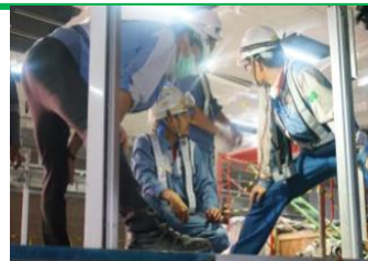
Indonesia: Construction of Jakarta MRT