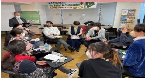
KCCP for Young Leaders: DX Practical Course by ICT Promotion

The project supports the development of advanced global engineering human resources and research activities in ASEAN countries, where the industrial structure and corporate activities are becoming more sophisticated. The project establishes an ASEAN-Japan inter-university network to train faculty members and conduct joint research.