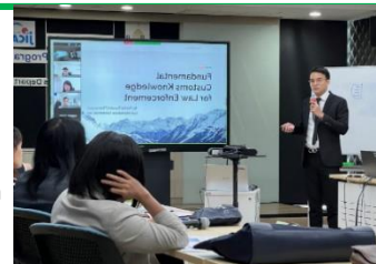
Thailand:Project for Enhancing the Human Resource Development Ca pacity of Customs Administration