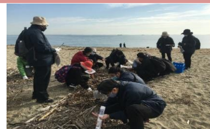
Training Program in Japan: Coastal Microplastics Survey