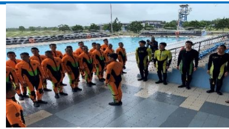
Malaysia: Training for Maritime Law Enforcement Agency (MMEA)