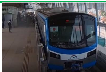
Viet Nam: Ho Chi Minh City Urban Railway