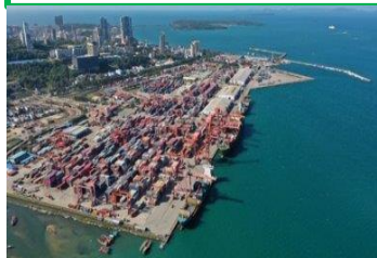
Cambodia: Sihanoukville Port