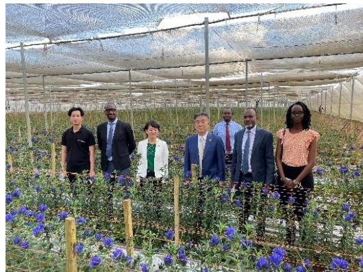
Flower production site hiring a maximum of 500 local employees