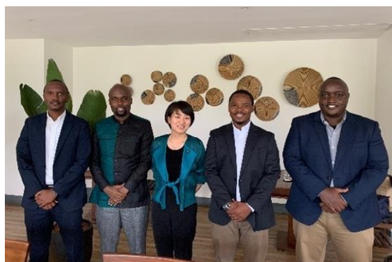
IT business people / ABE initiatives alumni