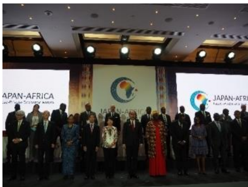
Japan-Africa Public-Private Economic Forum