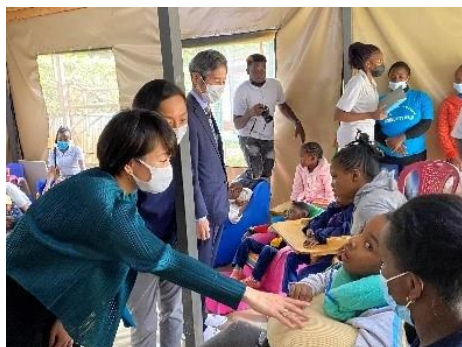
The Garden of SILOAM providing children with special needs and their families with comprehensive care and supported by Japan's ODA