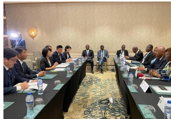
Meeting with leaders of African countries