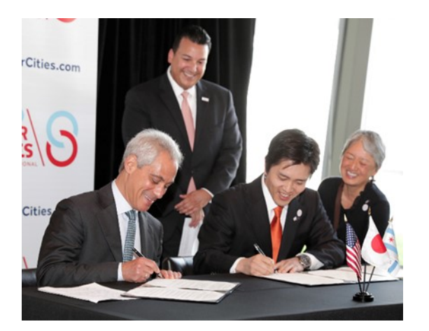
Signing ceremony between former Mayor Yoshimura and former Chicago Mayor Rahm Emanuel