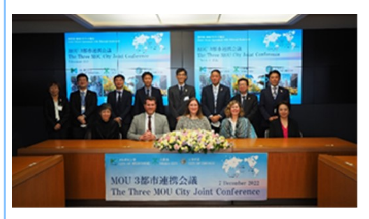
Sister Street Cooperation Tri-City Meeting

saka City has been promoting exchange and cooperation with Melbourne, which celebrated the 40th anniversary of its Sister City relationship in March 2018, and with Chicago, which celebrated the 45th anniversary of its Sister City relationship in June of the same year, by signing Sister Street agreements.