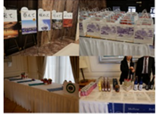
Sake, panels, exhibitions, and souvenirs

n the occasion of the visit of Governor Uchibori of Fukushima Prefecture to Germany, the Embassy of Japan in Germany co-hosted a Reception "Thank you from Fukushima Reception" with Fukushima Prefecture. The reception provided a presentation by Governor Uchibori, and local dishes as well as souvenirs from Fukushima Prefecture. It was a valuable opportunity to express gratitude from Fukushima for the solidarity and support extended by Germany in various ways in the wake of the Great East Japan Earthquake, and to promote the current situation of reconstruction and the attractiveness of Fukushima Prefecture.