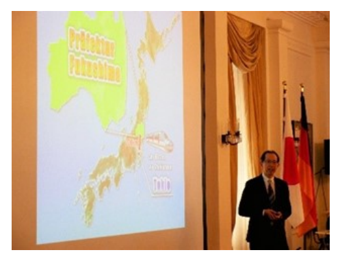
Presentation by Governor Uchibori of Fukushima Prefecture

Thank you from Fukushima Reception ~ Communicating the "present" of Fukushima through food, sightseeing, and local products (Embassy of Japan in Germany)