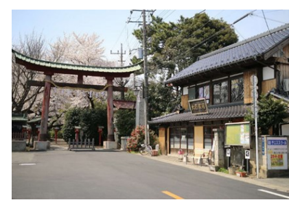
In front of Washinomiya Shrine appeared in the anime "Luckey Star"

Washinomiya Area in Kuki City collaborates with animation "Lucky Star" to promote the city.