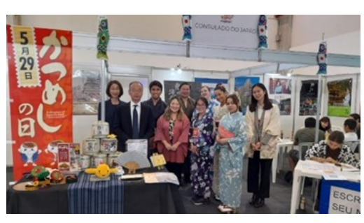
The Exhibition by Hyogo Prefecture and the participants at the Japan Festival