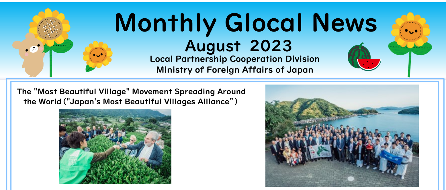
Tea picking experience in Wazuka Town