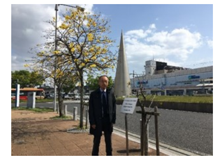
Monument in the shape of the Cathedral of Maringa in front of Kakogawa Station and ipe tree