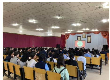
Meeting with high school students of Saynshand