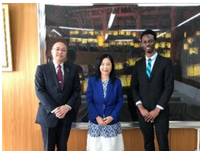
Photo with the mayor