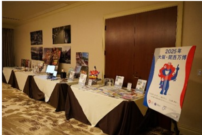
Exhibition booths by local governments of Japan