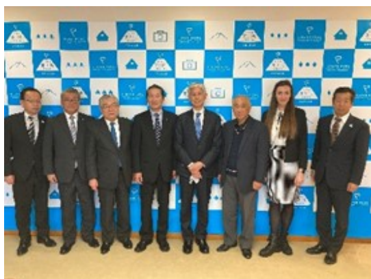
At Higashikawa Town Office