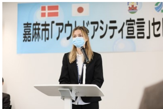
The ceremony to promote outdoor amusement in Kama City