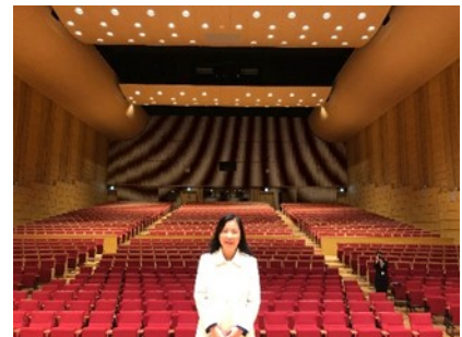
At Shelter Nanyo Hall