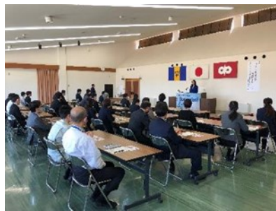
At the Nanyo City Office