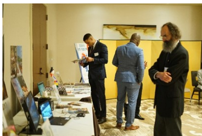
Visitors eagerly watching a local government PR video