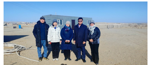
With local officials at a greening test area in Dornogovi province

N iigata Prefecture has been working on a JICA Partnership Program in Dornogovi province since 2009. Also, Shizuoka Prefecture has been continuing active friendly relations with Dornogovi province for more than 10 years. In this connection, an official of the Japanese Embassy in Mongolia visited Dornogovi province.