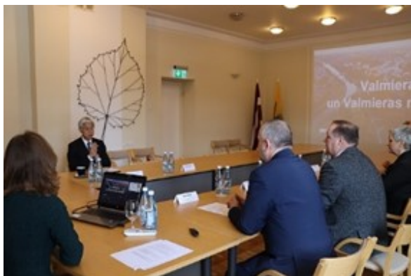
During the exchange of views in the Valmiera County Council