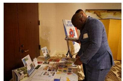
Visitors looking through brochures of the municipalities

O n February 21, the Consulate-General of Japan in Atlanta hosted the 2023 Emperor's Birthday Celebration Reception in Atlanta, Georgia. In this reception six local governments of Japan that have Sister City relationships with the Southeastern state and cities in the United States promoted their regional attractions with exhibition booths.