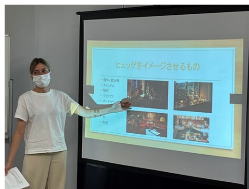
The open seminar about “Hygge”

K ama City puts a lot of efforts into promoting outdoor amusement as tourism resources after the example of Silkeborg City in Denmark. A Coordinator for International Relations from Denmark working at Kama City Office talks about strategies of Kama City and the Danish lifestyle: “Hygge.”