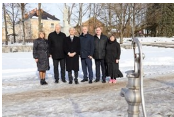
With the memorial pump of the Sister City relationship