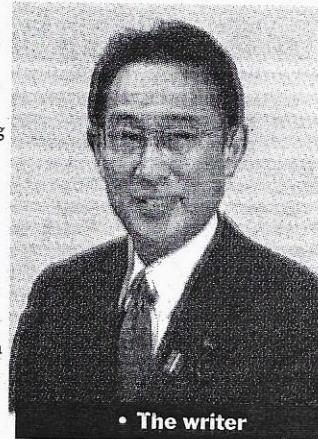
• The writer

Japan has been supporting Africa's own efforts to achieve peace and stability, the prerequisite for economic growth, investment and betterment of livelihoods, under the New Approach for