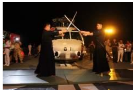
Exhibition of martial arts