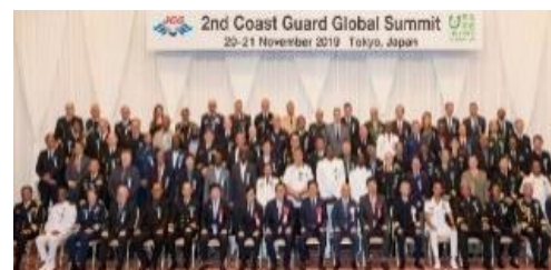
Coast Guard Global Summit