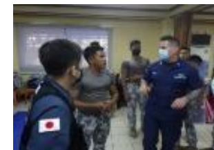
Capacity enhancement support through Japan-U.S. cooperation