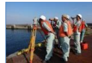
Support to enhance charting abilities