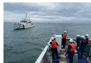
Support to enhance the capacity of patrol ships provided by Japan