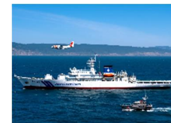
Japan-U.S. joint search and rescue drills