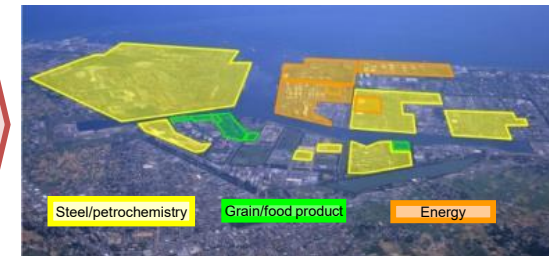
Current Kashima Port