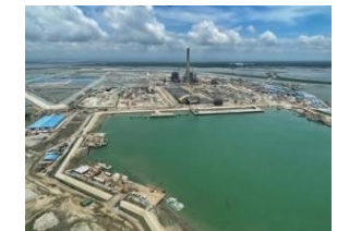
Matarbari deep-water port (Bangladesh)