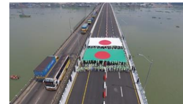
Meghna 2nd Bridge (Bangladesh) (Photo credit: OBAYASHI Corporation, Shimizu Corporation, JFE Engineering Corporation, and IHI Infrastructure Systems Consortium)