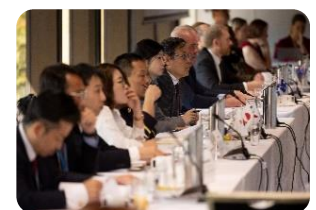
Quad Counter-Terrorism Tabletop Exercise