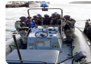
Support for enhancing maritime law enforcement capacity