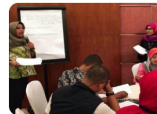
Increasing the resilience of communities through gender mainstreaming