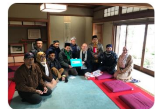
Dialogues between different cultures and religions