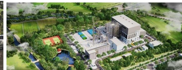
Waste-to-Energy Plant in Vietnam