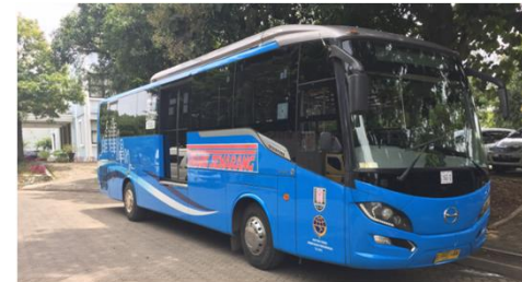
Introduction of CNG-Diesel Hybrid Equipment to Public Bus in Indonesia

Yellow: Main countries under discussion (India and Brazil agreed to continue discussions on the JCM respectively in the India-Japan Summit Joint Statement of March 2022, and the Declaration of Intent signed between Brazil and Japan in July 2022.)