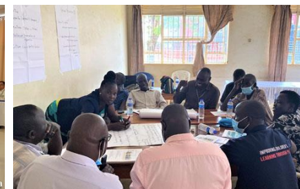
Planning for emergency assistance and independence support of refugees (Uganda)