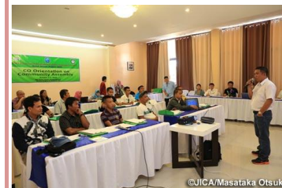
Orientation toward peace, held by the Bangsamoro Transition Commission (Philippines)