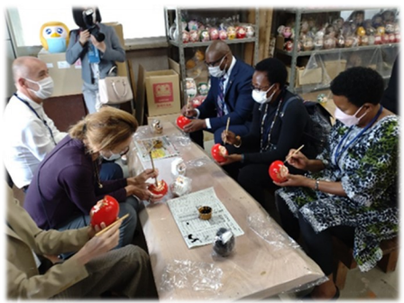
Painting Daruma doll(tumbler doll)