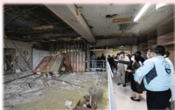
Visiting the remains of the earthquake, "Ukedo Elementary School in Namie Town"