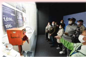
At The Great East Japan Earthquake and Nuclear Disaster Memorial Museum