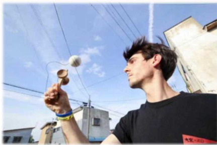
Playing with a Kendama