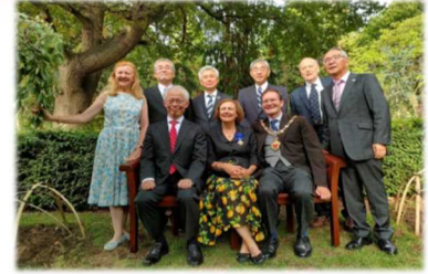
Donation of a garden bench at the ceremony at the Fukushima Garden

"Thank you from Fukushima" reception was held by the Embassy of Japan in the U.K. with Fukushima Prefecture and Motomiya City on September 7, 2022, and over 200 people attended. This reception, together with the 10th Anniversary ceremony of the opening of the Fukushima Garden in London, provided a special opportunity to promote the revitalization of Fukushima from the Great East Japan Earthquake and its charms such as local food and sake. The Embassy will continue to cooperate with local governments, including Fukushima Prefecture, to further promote the attractiveness of Japan.