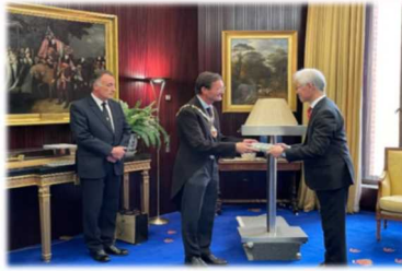
Visiting the Metropolitan Borough of Kensington