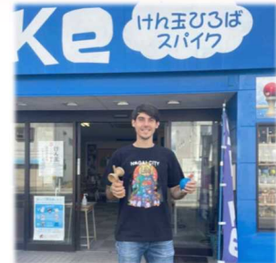
At "Kendama Hiroba SPIke"