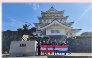
Visiting Chiba City Folk Museum (Chiba Castle)

~Beginning of Youth Exchange Program playing soccer~ (Chiba City and Asuncion City, Paraguay)