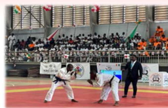
Japanese Ambassador's Cup "Judo" match in Cote d'Ivoire