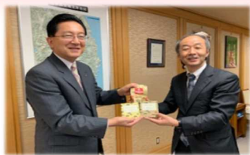
Visiting to Iwate Governor TASSO