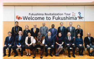
At the reception with Governor UCHIBORI

O n November 29 and 30, 2022, the Ministry of Foreign Affairs of Japan and Fukushima Prefecture conducted Diplomats' Study Tour under the theme of "Revitalization". 15 participants including Ambassadors and other representatives from 10 countries visited various sites and facilities, such as Ukedo Elementary School in Namie Town, The Great East Japan Earthquake and Nuclear Disaster Memorial Museum etc. It is expected that this tour has provided a good opportunity for the participants to deepen their understanding of Fukushima's challenges and attractiveness further expand the exchanges between the participants' countries and Fukushima.