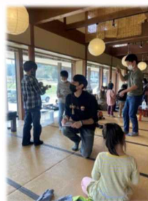
Kendama Class in Nagai City