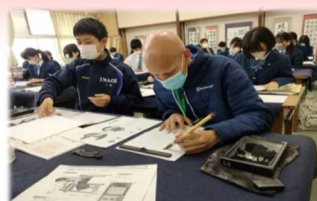
Experience of calligraphy at the School in Chiba