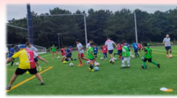
Teaching soccer to Youth Soccer Teams in Chiba by the workshop Instructors

C hiba City has had a Sister City relation with Asuncion, Republic of Paraguay since 1970, and on the occasion of the 50th anniversary of the relationship in April 2019, Chiba City decided to start a youth exchange program through soccer in order to further develop exchange in sports and culture. The exchange between the youth of the two cities seems to have raised their awareness of multicultural society. Chiba City is going to continue the exchange program with Asuncion City in the future.