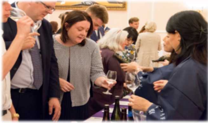
During the reception