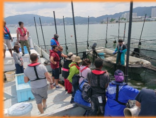
Traditional inland water fisheries in Biwa Lake which have developed along with rice paddy farming.

This July, Two regions in Japan have been formally recognized as GIAHS by the Food and Agriculture Organization of the United Nations (FAO). Both regions have been interacting with other countries and regions in the fields of agricultural products, environmental protection and taking advantage of each region's unique characteristics.