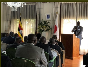
Lecture on the Sister City relationship