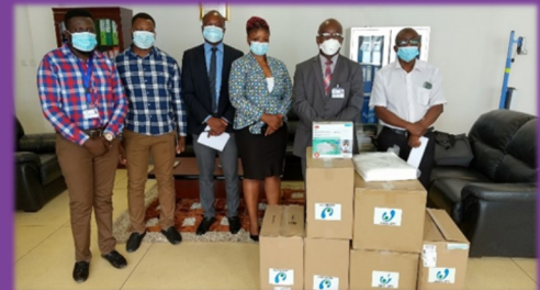
Medical supplies donated by Asahi City to Levy Mwanawasa University Teaching Hospital in Zambia

Asahi City in Chiba Prefecture, which had actively kept international exchange activities, got to know about Zambia which was looking for a pre-games training camp site in Chiba Prefecture in 2019. Asahi City then offered to invite Zambia to host the camp and it led to the Host Town exchange. Unfortunately, the pre-game training camp was cancelled due to the spread of COVID-19 though, Asahi City has continued to deepen ties with Zambia even after the Games with a view to post-pandemic, for example, through the donation of medical masks etc. from the City to Zambia or online exchanges between students of both countries.