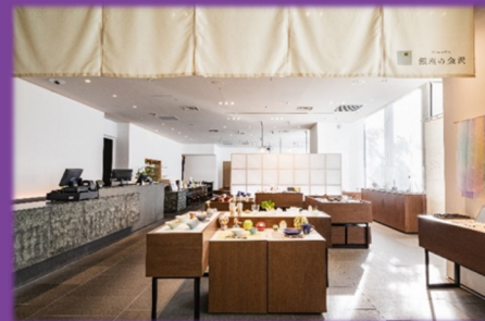
Front entrance of the shop