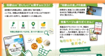
Portal Website of Wakayama's Local Products Online Store