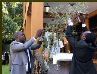
Strip of paper tying onto bamboo grass by the member of parliament in the hope of strengthening Japan-Uganda local government exchanges

On July 6, the Embassy of Japan in Uganda held the Round Table Talk with members of the Ugandan parliament to introduce the Sister City relationship between both countries. A Diet member from Gulu City, the only city in Uganda having Sister City relationship with Japanese local government, gave a lecture on the sister city exchanges with Izumisano City in Osaka Prefecture. After the lecture, the participants exchanged their hopes for the future collaboration with Japanese local governments.