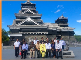
Group photo at the Kumamoto Castle

On September 12 and 13, the Ministry of Foreign Affairs of Japan and Kumamoto City held a Diplomats' Study Tour under the theme of "Recovering from the Kumamoto Earthquake & Building Our Future" in Kumamoto Prefecture. 15 of ambassadors and other participants from 13 countries visited various sites and facilities, such as Kumamoto Castle. It is expected that this tour will help the participants deepen their understanding of Kumamoto's attractiveness and efforts toward the reconstruction. We hope that the exchanges between the participants' countries and Kumamoto will be long-lasting for a long time.