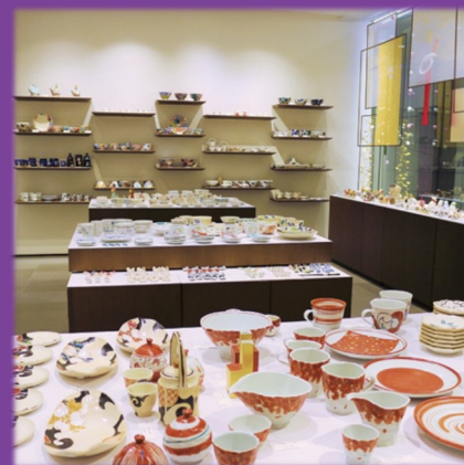
Gallery decorated with a variety of crafts

Ginza no Kanazawa (Means "Find Kanazawa's attractiveness in Ginza, Tokyo") is an "antenna shop" (= local products shop promoting local specialties and tourism in other than its local area) of Kanazawa City, Ishikawa Prefecture. Since its opening in 2014, the shop has been promoting traditional entertainments and crafts, food culture, etc. The shop has many interesting contents, not only dining restaurant but also special gallery, events, and online shops. Visitors will surely feel the attractiveness with all five senses!