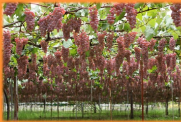
Grapes cultivated in the Kyoutou region of Yamanashi Prefecture