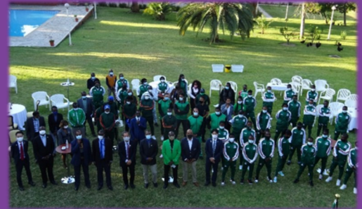
Send-off party for Zambian Olympic delegation