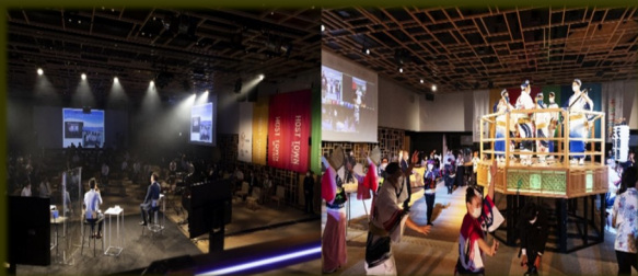
Scenes from the Host Town Festival (Stage programs and a performance of Awa Odori)

HOST TOWN FESTIVAL ~GO TO 2025~ was held at Happon-en Tokyo under the theme of what we can do to build on the legacy of the Tokyo 2020 Host Town Initiatives for the future especially for the Expo 2025 Osaka, Kansai, Japan. Japanese local government officials and the counterparts from Host Town partner countries made impassioned speeches about the important legacies created thanks to the Host Town exchanges. They also presented about exchange plans in the future passionately.