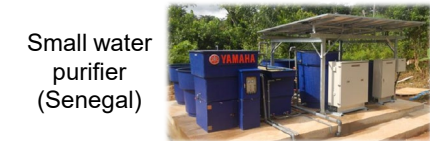
Small water purifier (Senegal)