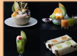
Signature menu with lavish use of melon

"Cafe Melon & Roman (=Romance in Japanese)" is an antenna shop of Tsugaru City, Aomori Prefecture, opened in Kagurazaka, Tokyo, in 2019. This is Japan's first antenna shop specializing in melons, where visitors can experience them through all five senses: tasting, smelling, seeing, hearing, and touching. As you may know, Aomori Prefecture is famous for apples though, Tsugaru City uses not apples but melons as its specialty and as a hook to promote the city. Until the end of August, the Cafe provides special sweets menu for the summer, using plenty of local "Takami", a major melon of the region known as high quality. Well-formed premium muskmelons made in Tsugaru City with 17 degrees Brix (sugar content) or higher are available just in the summer. The Cafe has many attractive contents and interesting tricks for visitors. Please enjoy Tsugaru's high quality melons of which is Tsugaru's pride!