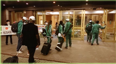
Boosting the Nigerian athletes at the departure from the airport in Abuja, the capital of Nigeria, to Tokyo