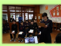
The Junior high school students in the village enthusiastically explaining online about the charms of Uken in English to the Egyptian students