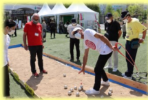
Visitors enjoying petanque, a ball game originated from France