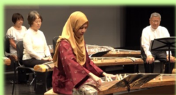
Playing the Koto at an online cultural exchange event