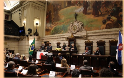
Approximately 100 local citizens attended the award ceremony of the honorary