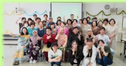
Celebrating "Hari Raya (holiday of the end of the fast)" with the local community