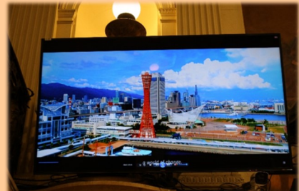
Introducing the Kobe City on the large-screen in the council chambers

T he sister city relationship between Rio de Janeiro City and Kobe City dates back to 1968.