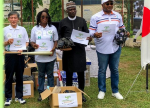
Hand-Over ceremony of Baseball equipment

K isarazu City made the Nigerian athletes delegation feel like their "real home" during the Tokyo 2020 Games, providing them with state-of-the-art facilities and Nigerian cuisine made with Japanese ingredients. Even after the Games, Kisarazu City, which keeps the sports exchange with Nigeria, donated baseball and soccer equipment to the Nigerian citizens through the sports events in Nigeria. Through the sports, Japanese typical life-style and behavior pattern such as punctuality or taking good care of equipment might be delivered as well, resulting in the country's economic development and further business exchanges between two countries. It is expected that the relationship initiated from the Host Town exchange will continue for long term.