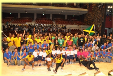
Pre-games training camp of Jamaican delegation in 2015