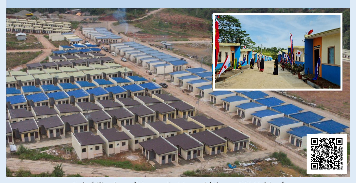
Rehabilitation of Houses in Marawi