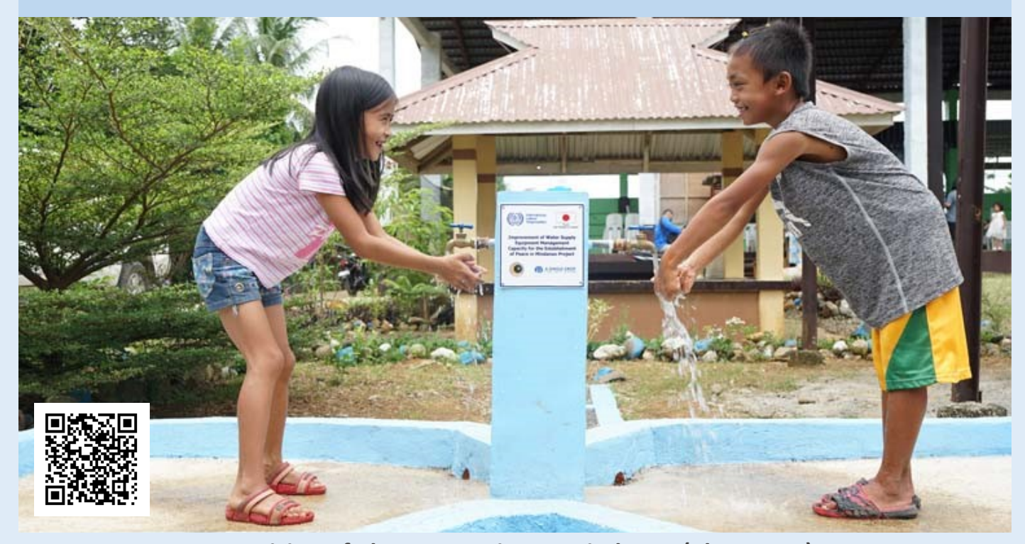
Provision of Clean Water in Maguindanao