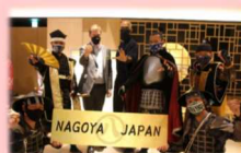
Stage performance (Left: Nagoya Omotenashi Busho-tai Right: Yamaguchi City Upcycle Kimono Fashion Show)

On March 22, 2021, the Ministry of Foreign Affairs of Japan hosted the event "Local x Global -A special Event for Future Interaction-" jointly with the City of Nagoya in Aichi Prefecture and Yamaguchi City in Yamaguchi Prefecture at Happon-en Tokyo. 65 guests mainly from the diplomatic corps stationed in Tokyo, foreign chambers of commerce in Japan and the private companies participated in the event. At the beginning of the event, Mr. Ishikawa Hiroshi, Deputy Minister of the Ministry of Foreign Affairs (MOFA), delivered the opening remarks. Then, the representatives from the City of Nagoya and Yamaguchi City gave presentations on the various attractive features of each city in the first part of the event. Both cities exhibited their tourist information, local products, traditional crafts, and other aspects in their PR booths in the second part of the event. Foreign Minister Hayashi joined in the event and visited PR booths with the guests. Check the detail and digest movie