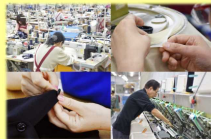
Manufacturing of hand-sewn knitwears by craftspeople