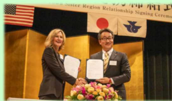
Signing of "Memorandum of Friendship" between Toyoyama Town and Grant County (December 2019)

Grant County, located in the central part of Washington State, has a thriving agricultural industry and aerospace industry, etc. In 2016, a sister airport relationship was established between the prefectural Nagoya Airport and Grant County International Airport. In December 2019, Komaki City and Toyoyama Town in which the prefectural Nagoya Airport is located, and the State of Washington signed a Memorandum of Understanding (MOU) of Friendship. In spite of the unexpected pandemic which happened just after the signature, it is strongly expected that the exchange will be developed anyway.