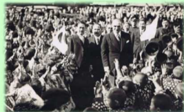
Argentine Minister to Japan (at the time) received a warm welcome during a visit to a local elementary school (1935)