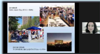
Ms.Lilla introducing Idaho Japan Day