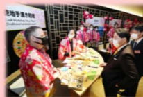
PR booths (Left: Yamaguchi City Tokuji Washi, traditional handmade papers Right: The City of Nagoya Wagashi, Japanese Sweets)