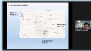
Idaho has only two sister cities

The online event was held for the first time at the Consular office in Portland at the end of January this year. It was called "More Than Just Potatoes! Introducing the City of Boise, Idaho." Here is an overview of the day's events. A consultation of Boise State University with the Consular office led to the participation of great number of young people who wanted to introduce the charms of Boise City to Japan. Even Japanese mayor and city council members participated in this event. It provided a great opportunity for the future. It was an event not to be missed.