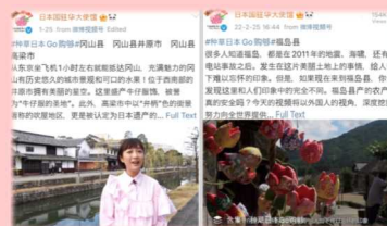
Presentations by the Embassy's SNS Account

From last December to the end of February, the Ministry of Foreign Affairs and the Embassy of Japan in China had held a local attractions' promotion event in close collaboration with Japanese local governments, organizations and private companies. The objective of this project is to spread the information on tourism, local culture and cuisine/food in various parts of Japan. With the participation of 67 Japanese local governments and organizations, a lot of attractive movies of those local regions were posted on SNS accounts of the Embassy etc. Japanese restaurants located in China, wholesalers or EC market sites as the partners of this project had effectively used the common logo of the project to cheer it up as well. A lot of attractiveness of Japan's local regions were conveyed to China through this project.