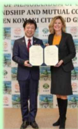
Signing of "Memorandum of Friendship" Komaki City and Grant County (December 2019)