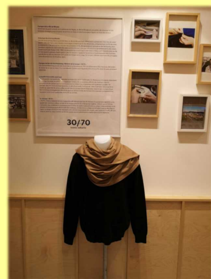
Exhibition in Paris, France

On March 22, 2021, the Ministry of Foreign Affairs of Japan hosted the event "Local x Global -A special Event for Future Interaction-" jointly with the City of Nagoya in Aichi Prefecture and Yamaguchi City in Yamaguchi Prefecture at Happon-en Tokyo. 65 guests mainly from the diplomatic corps stationed in Tokyo, foreign chambers of commerce in Japan and the private companies participated in the event. At the beginning of the event, Mr. Ishikawa Hiroshi, Deputy Minister of the Ministry of Foreign Affairs (MOFA), delivered the opening remarks. Then, the representatives from the City of Nagoya and Yamaguchi City gave presentations on the various attractive features of each city in the first part of the event. Both cities exhibited their tourist information, local products, traditional crafts, and other aspects in their PR booths in the second part of the event. Foreign Minister Hayashi joined in the event and visited PR booths with the guests. Check the detail and digest movie