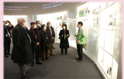
Visit to the Great East Japan Earthquake and Nuclear Disaster Memorial Museum