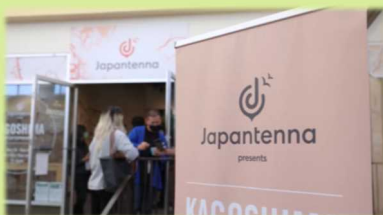
Japantenna for Kagoshima