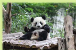
A Panda in Sichuan Province

On January 26, 2022, Wakayama Prefecture and Sichuan Province in China signed the Agreement on the Establishment of Friendly Relations! The beginning of the exchange between two cities was giant pandas sent from Sichuan Province to Wakayama prefecture in 1994. Since then, both cities have been deepen their relationship even in the COVID-19 pandemic by using online tool. They will develop the bilateral exchanges collaborating on various issues such as youth, disaster prevention and mitigation, tourism, or education. We hope that their face-to-face exchanges will be realized after COVID, expecting that it comes in the near future.