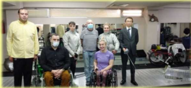
Visit to the Georgian Paralympic Committee