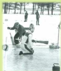
Practice scene with a mini barrel and broom (1980, Tokoro Town)