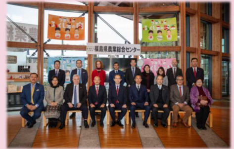
Group photo at Fukushima Agricultural Technology Centre