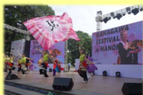
YOSAKOI dance at Kanagawa Festival in Hanoi