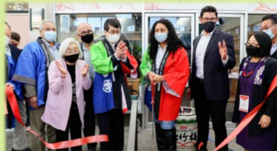
Ribbon cutting by the Mayor of San Francisco and Consul General of Japan in San Francisco

“ J apantown” in San Francisco plays an important role in promoting Japanese culture among the Japanese American community, as well as the various societies in the United States. The number of visitors to “Japan Center”, a mall located in the center of “Japantown”, was getting to decreased due to the COVID-19. Today, although customers have been returning to this mall, the economic damage to the shops in “Japantown” still remains and we can see empty shops in the mall. The project “Japantenna” was set in motion in order to bring back a live atmosphere to “Japantown” which was in the critical situation at that time. The first “Japantenna” focused on Kagoshima Prefecture and used a vacant shop space in the Japan Center to hold an exhibitions introducing local products and tourism resources such as shochu, Japanese tea and handicrafts delivered from Kagoshima Prefecture. Around 6,000 people in total visited there. This event greatly contributed to raising awareness of Kagoshima’s original attractiveness in San Francisco.