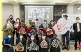
Online workshop between Tokushima Commercial High School and Free University of Tbilisi

T okushima Prefecture was registered as a Host Town of Georgia for the Tokyo 2020 after hosting pre-training camps of the Georgian team for Rugby World Cup 2019. The heartwarming exchange between the players and local residents at that time led to the Host Town registration. As a Host Town of a Harmonious and Inclusive Society, Tokushima Prefecture has also promoted interactions with Georgian Paralympic athletes, for example, exchanges between Tokushima Commercial High School and Georgian women's wheelchair fencing athletes. Even after the Tokyo Games, the Prefecture tries to find the ways to establish a solid relationship with a municipality in Georgia working on the theme of the Harmonious and Inclusive Society. In 2022, which marks the 30th anniversary of the establishment of diplomatic relations between Japan and Georgia, it is expected that the Host Town exchanges will develop more active by promoting collaborations in the field of rugby or with youth of the above-mentioned local High School, Shikoku University and the Georgian students learning Japanese at the Free University of Tbilisi.