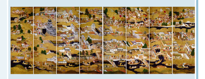
Japanese folding screen depicting the cityscape of Osaka during the Toyotomi period (Collection of Eggenberg Palace, Graz, Austria)

Friendship castle alliances between Osaka Castle and overseas castles (Osaka Castle)