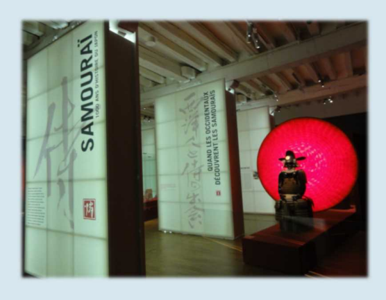
"Samurai Exhibition" at the Castle of the Dukes of Brittany (Bretagne, France)

he Osaka Castle has a friendship agreement with the famous castles in the world such as Eggenberg Palace in Austria and the Dukes of Brittany (Bretagne) in France. The first friendship agreement with a foreign castle was started from an old folding screen found in Austria. It was a screen painting in the collection of Eggenberg Palace, and it unmistakably described solemn Osaka Castle built by TOYOTOMI Hideyoshi and its castle town at the time.