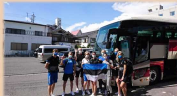
Estonian Fencing team

Saku City in Nagano Prefecture welcomed the pre-games training camps of fencing, Judo, wrestling and track and field (decathlon) for the Tokyo 2020 Olympic and Paralympic Games this summer as a Host Town of the Republic of Estonia. The exchange has begun since 1998, when a staff of the Embassy of the Republic of Estonia in Japan found by chance a road sign designated "Saku" City on the Joshinetsu Expressway. Then, Saku City in Nagano and Estonia, sharing the same name, signed a friendship city agreement in 2007 and a sister city agreement in 2019 which permits the relationship stronger. Various events such as tourism promotions and music live concerts were held in Saku City of Nagano in order to provide information on Estonia. Even, the Estonian food was served in elementary and junior high schools so that the citizens could get familiar with Estonia. The booms and the enthusiasm will be expected to be expanded more.