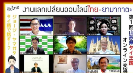
The 1st online exchange event between Yamagata Prefecture and Thailand

First online exchange event with Thailand (Yamagata Prefecture)