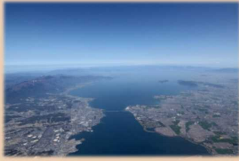
Magnificent landscape of Lake Biwa