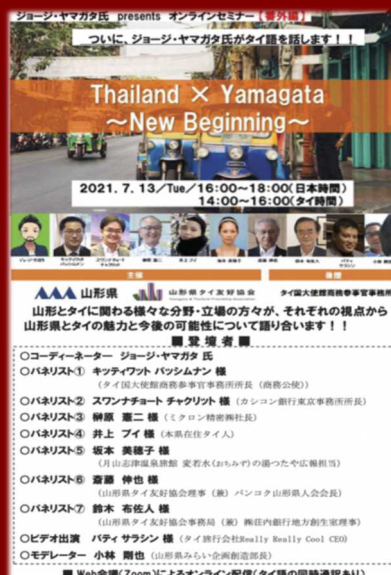
Flier of the event

New type of exchanges between Yamagata Prefecture and Thailand are in progress. The first online exchange between them was held this July which was involving various organizations such as Yamagata Prefecture, Yamagata-Thailand Friendship Association, the Embassy of Thailand in Japan, a bank and a travel company in Thailand, local companies in Yamagata etc. Gathering together online, they actively exchanged various opinions as if they were meeting in live. Even a virtual YouTuber joined in. It might be a good opportunity for them to kick off their friendship through the direct and indirect ways.