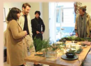
Tottori Crafts Exhibition in France