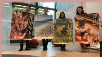
Attractive posters sent from Toyama to Oregon

The state of Oregon, located on the west coast of the United States, is famous for the City of Portland that has the largest population in the state and is well-known for its lifestyle and creative culture. In addition, thanks to deep forests stretching across the state, the forest industry is a major and remarkable feature in this area. This feature is common with Toyama Prefecture in Japan. Based on the same industrial charms, their exchanges have continuously developed for 30 years. However, only a few people in both communities know this relationship in fact. For that, they have just started to make efforts to appeal their relationship in both digital and analog ways such as monthly online meeting and exchanging each paper-made poster. It is expected that they will continue to make unique attempts contributing to strengthening their cordial tie.