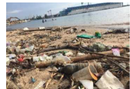
Marine plastic debris washed ashore