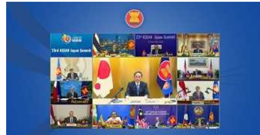
The 23 rd ASEAN-Japan Summit in 2020