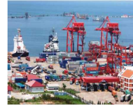
Sihanoukville Port (Cambodia)