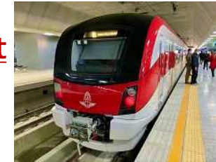
Red Line Commuter Train System (Thailand)