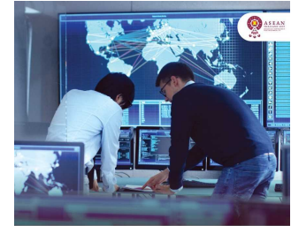
ASEAN-JAPAN CYBERSECURITY CAPACITY BUILDING CENTRE (AJCCBC)

ASEAN-Japan Cybersecurity Capacity Building Centre (AJCCBC)