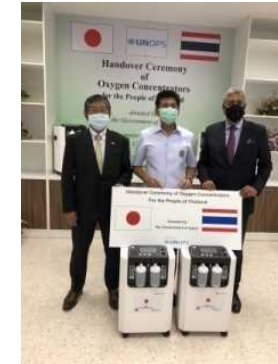
Donation of oxygen concentrators to Thailand