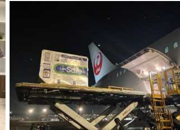
Donation of Vaccines to Indonesia