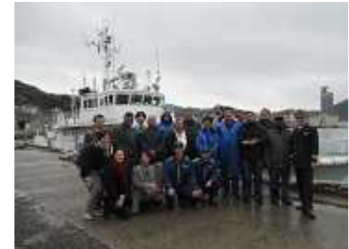
(Reference : Knowledge Co-Creation Program: "Policies and Countermeasures against IUU Fishing" (JICA HP))