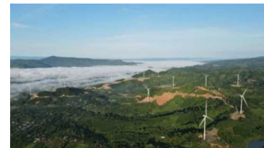
12 wind turbines in Viet Nam