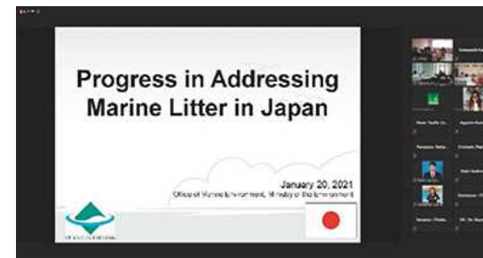
Online Training on Marine litter including micro plastics