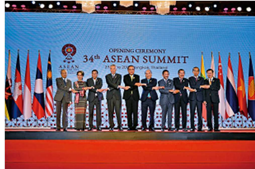
The 34 th ASEAN Summit in 2019