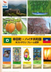
Host Town postage stamp frame of Kota Town and Haiti with their various charms.

T he name 'Haiti' is pronounced "Aiti" in its official language, which is similar to the sound "Aichi" Prefecture by chance. This similarity led to the Host Town registration of Haiti by Kota Town, Aichi Prefecture. Haiti encountered a series of national crisis such as the assassination of the Haitian President in July 2021, just prior to the Tokyo 2020 games, and the Haiti Earthquake in August 2021. Kota Town has always cared about and supported Haiti. For example, the officials and the residents in the Town joined in an online exchange event for welcoming the Haitian athletes on July 14th. In the beginning of the event, all of attendees observed a moment of silence in honor of the late Mr. Moïse, former Haitian President. After the friendly exchanges between attendees and the performance of beautiful songs, the attendees from Kota Town started to raise "Alle! Haïti! (Do! Haiti!)", cheering message to Haitian athletes. Kota Town has set up donation boxes in the town hall immediately after the Haiti Earthquake. After the Tokyo 2020 games, the Town is going to hold an art exhibition with Haitian art selection later this year. The relationship built through the Host Town Initiative will keep lasting.