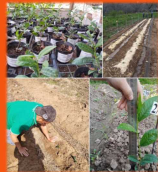
(Upper left) Transported saplings (Upper right) Cultivation study site in Uzbekistan (Lower left) Uzbek planting saplings (Lower right) Checking the growth of saplings

M aizuru City has become a Host Town of Uzbekistan based on "a special bond of the repatriation" after the WWII. The residents of Maizuru City have promoted various exchanges in the fields of sports, culture and civil activities with Uzbek people, and deepen its understanding on Uzbek culture through visiting the country, holding exhibitions on Uzbek culture and theater performances by Uzbek artists. Furthermore, Maizuru City has established subsidy systems for those who go to study abroad to acquire industrial skills, as well as the long-term care workers to work in the City. In addition, the City provides various supports such as tea cultivation technical cooperation. Such a wide range of cooperations contributes much to the development of human resources and the creation of new industries in Uzbekistan.