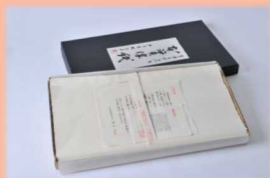
Hon Mino Washi

Characterized by its elegant color and elegant texture under the sunlight.