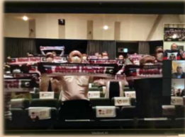
Residents of Kota Town raised cheering messages to Haitian athletes at an online exchange event. (July 2021)

(Kota Town in Aichi Prefecture and the Republic of Haiti)