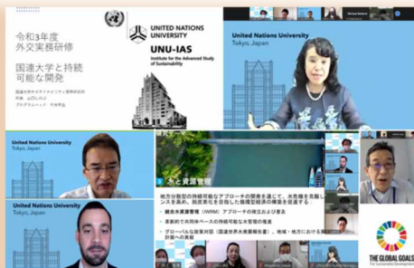
Online lecture by UNU-IAS

Ministry of Foreign Affairs of Japan (MOFA) has implemented the personnel exchange program with local governments of Japan over the past years. In this program, officials from local governments work first at MOFA in Tokyo as OJT, then are appointed to the Japanese Embassies or Consulates abroad for several years. On September 7, 2021, 21 trainees currently working at MOFA took lectures by UNU-IAS on the theme of "United Nations University and Sustainable Development". They learned about global issues such as SDGs, waste management, climate change and ESD (Education for a Sustainable Society). It was a very meaningful opportunity for them to think globally and locally.