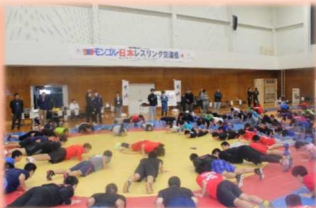
Wrestling exchange meeting between Mongolia and Japan (February 2019)

Bright Bond lit up by warm tenderness from citizen(Miyakonojo City in Miyazaki Prefecture and Ulaanbaatar in Mongolia)