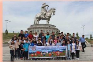
Miyakonojo City youth delegation to Mongolia (At Ulaanbaatar, July 2019)

T he beginning of exchanges between two cities dates back in 1992 when some citizens of Miyakonojo City visited Mongolia. There, they found nomads and children living only with a candle light, and wanted to bring light to them. After they went back to Japan, they established a small organization which made and sent wind power generators for Mongolia. These actions have continued for years and years. Based on these efforts of the organization, Miyakonojo City and Ulaanbaatar established sister city relationship in 1999.