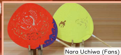
Nara Uchiwa (Fans)

You may be fascinated by its stylish appearance once you step into the shop. You will also find a high-quality, sophisticated space, as if you were in Nara, with a dark red color reminiscent of the 6th and 8th centuries the Asuka and Nara periods. Why don't you put yourself in such an unusual space feeling exceptional "Nara time"? You will find good old new things there, and will also feel the deep taste of Nara. Enjoy feeling "Nara color" even in Tokyo!