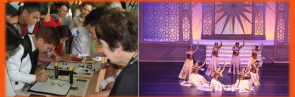
Exchange in Noriko Class & Maizuru Performance in Maizuru City with the participation of members of the Navoi Theater

"Special bond through the repatriation", expanding circle of friendship and deepening ties-Host Town Exchange with Uzbekistan, a country on the Silk Road- (Maizuru City, Kyoto Prefecture)