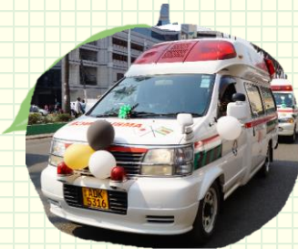
Supply of Recycled Ambulances to Harare, Bulawayo and Mutare (St John's Ambulance Association Zimbabwe, 2013)