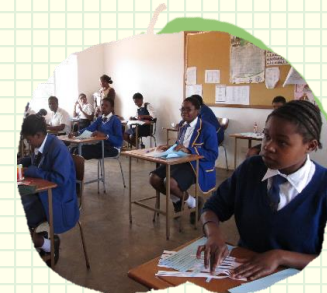
Construction of a Classroom Block for Deaf Students at King George VI Centre in Bulawayo (King George VI Centre, 2012)