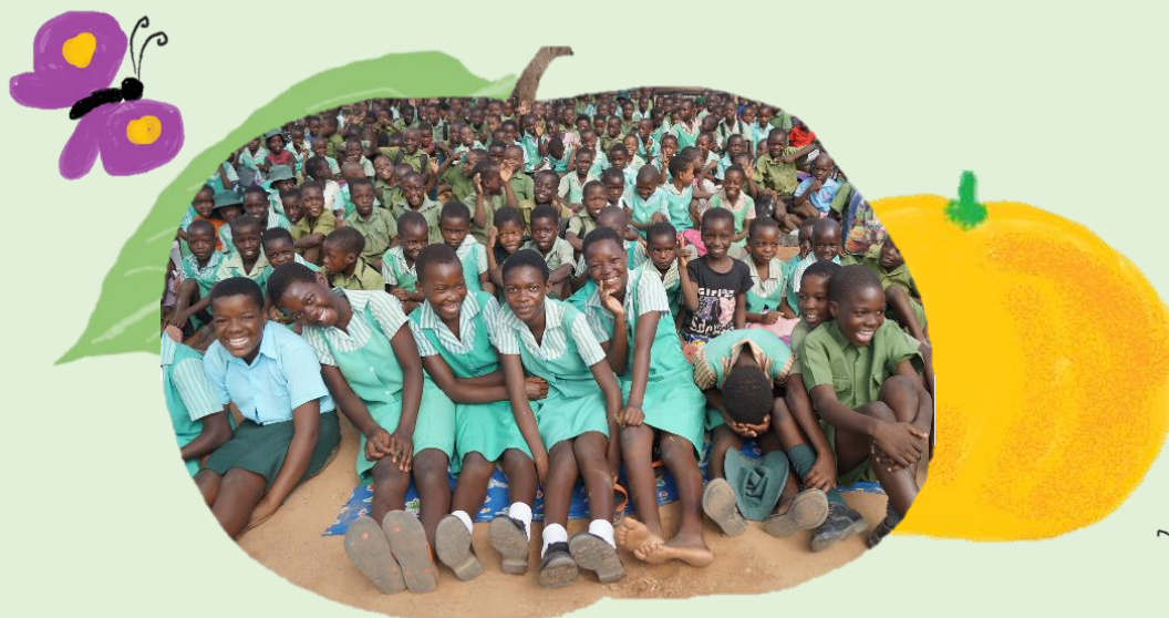
Improvement of the Educational Environment at Mushumbi Primary School in Mbire District (Lower Guruve Development Association, 2017)

The recipient is required to consult with the Embassy of Japan in advance to get prior approval. A letter mentioning the change of plan in detail must be sent to the Embassy for approval BEFORE THE PLANS ARE CHANGED. Any change in the project implementation can be made only when the Embassy of Japan judges it unavoidable or appropriate. In case any unapproved deviation from the agreed project plan is detected, the Embassy of Japan may demand a refund of the grant.