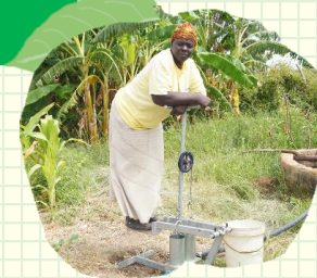
Improvement of Farming Skills in Gweru District (HELP, 2012)

For the full list of GGP Projects in Zimbabwe from 1989 to 2018, please see pages 12-15.