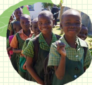
Improvement of Sanitation and Hygiene at Nyanhewe Primary School in Kariba District (Nyanhewe Primary School, 2014)