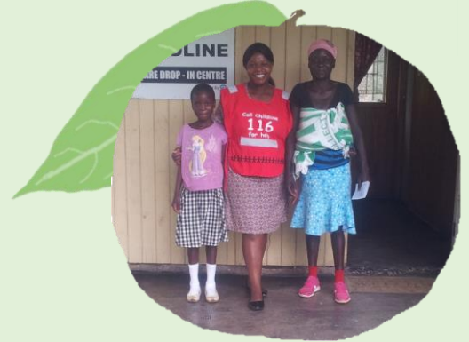
Construction of an Emergency Call Centre and Children's Drop-in Centres (Childline Zimbabwe, 2012)