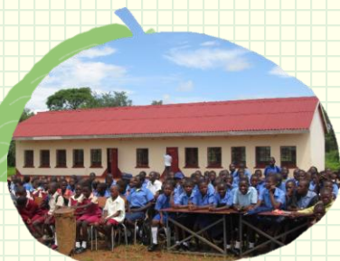
Improvement of the Educational Environment At Chishayabvudzi Secondary School in Chegutu District (Africa Book Development Organisation, 2015)