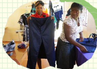
Construction of a Vocational Training Centre in Harare (Oasis Zimbabwe, 2013)