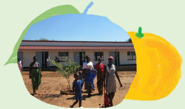
Improvement of Facilities for Medical Services and Maternal and Child Health in Hwange District (Wild4Life, 2015)

Mine clearance allows the community safe access to water sources and children safe passage to school.