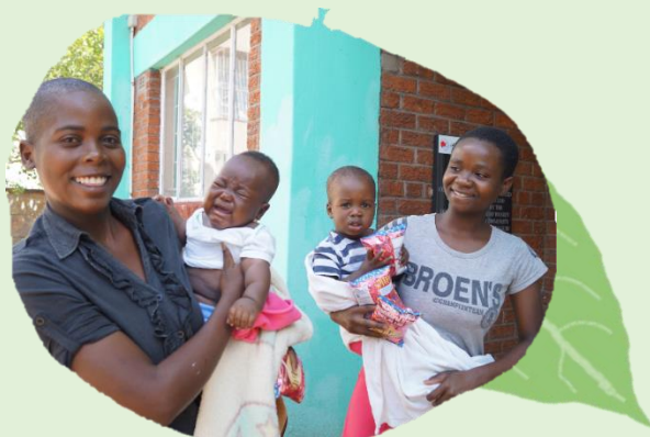
Construction of a Counselling and Care Centre for Survivors of Gender-Based Violence (Musasa Project, 2012)