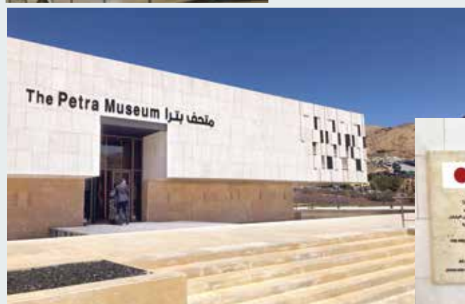
Construction of Petra Museum (Cultural Grant Assistance) (FY2013-2014: 784 million yen)