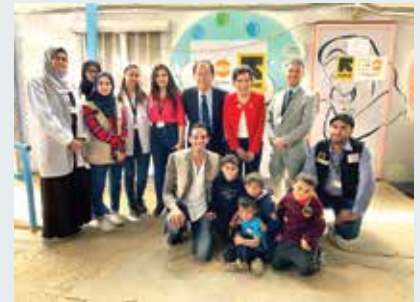
UNFPA: Opening Ceremony at Azraq refugee camp