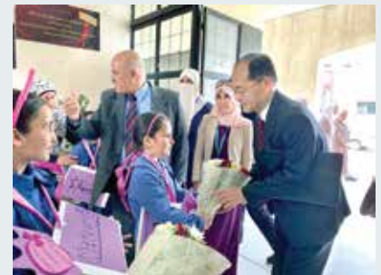
UNICEF: Visit to School in Amman WASH project