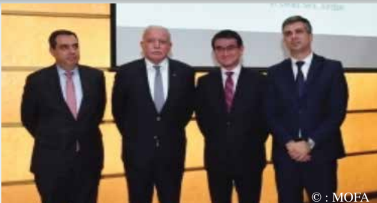
The Sixth Ministerial-Level Meeting of the Four-Party Consultative Unit chaired by Kono Foreign Minister (2018)

In 2006, Japan proposes its concept of creating “The Corridor for Peace and Prosperity” in cooperation with Israelis, Jordanians and Palestinians. The concept is to work collaboratively to materialize projects that promote regional cooperation for the prosperity of the region, such as establishing the Jericho Agro-Industrial Park (JAIP) in the West Bank and facilitating the transportation of goods.