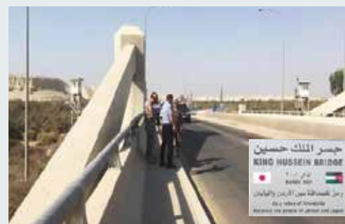
Construction of the King Hussein Bridge (FY 1999: 1,215 million yen)