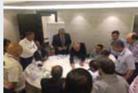
Project for Capacity Development of Vocational Training Corporation in the Field of Occupational Safety and Health (2017-2021)