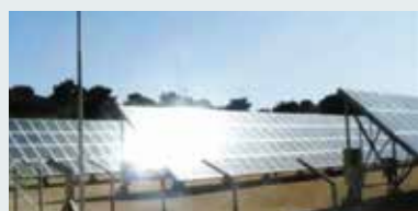
Project for Introduction of Clean Energy by Solar Electricity Generation System (FY2010 : 640 million yen)