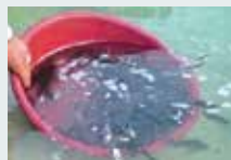
Trilateral Cooperation Project "Introduction of Advanced Agricultural Technology under Trilateral Cooperation (1) Tropical fruits production (2) Tilapia farming experiment