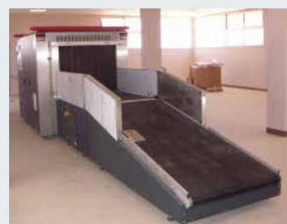
Project for Improvement of Airport Security Equipment (FY 2009: 1,473 million yen)