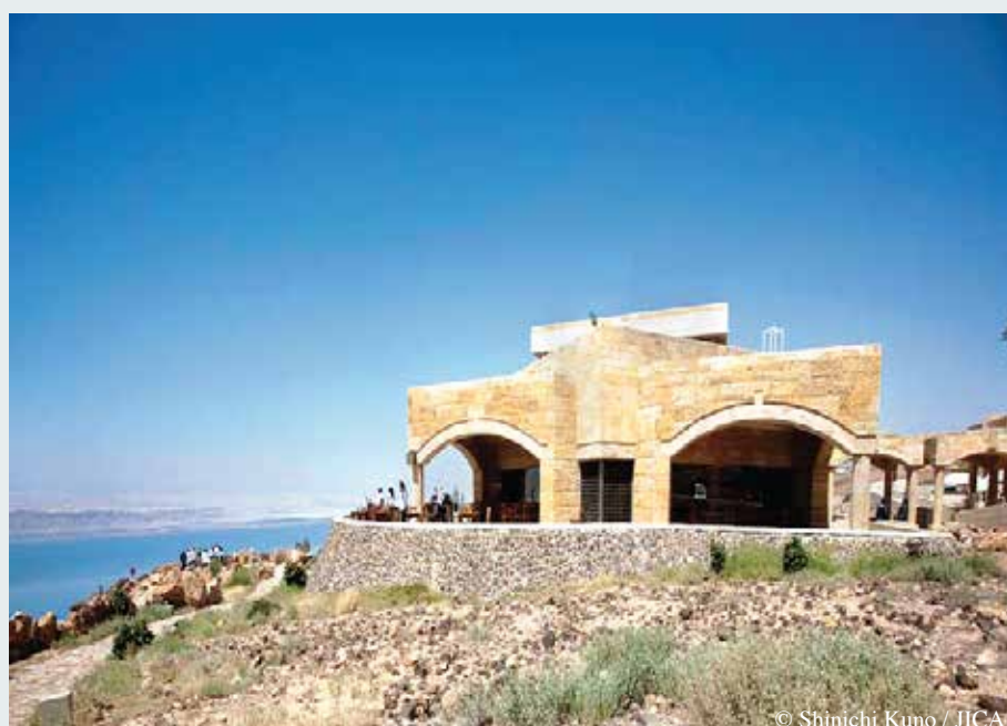
Dead Sea Panorama Complex constructed in 1999 with “Tourism Sector Development Project” (in total 7,199 million yen)

*Japanese Fiscal Year (FY) runs from April 1 st to March 31 st