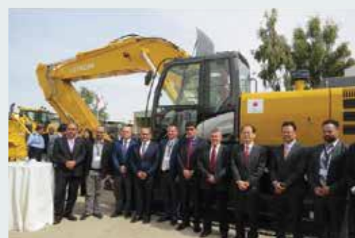
Hand over ceremony of Machinery for solid waste management to Ministry of Municipal Affairs (2018)