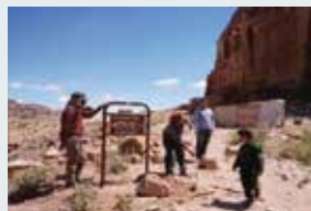
Project for Community-based Regional Tourism Development in Petra Region (2015-2020)