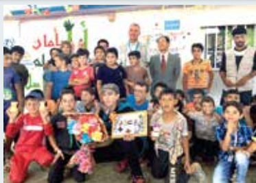
Grant aid for UNICEF, at the launching ceremony

Japan provides Emergency Grant Aid for the governments of affected countries or international and other organizations (including Red Cross and Red Crescent Societies), with a view to providing urgent support for refugees, internally displaced persons (IDPs), or people affected by natural disasters and/or conflicts.