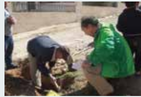
Project for formulating water supply plan for the host communities of Syrian refugees (2013-2016)