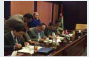
Project for the study on electricity sector master plan in Jordan (2014-2017)