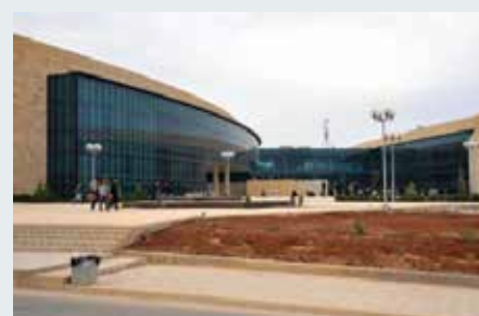
Jordan University of Science and Technology in 2012