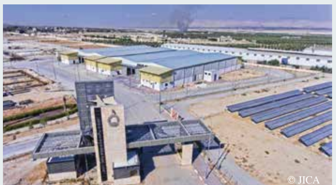
JAIP: Jericho Agro-Industrial Park