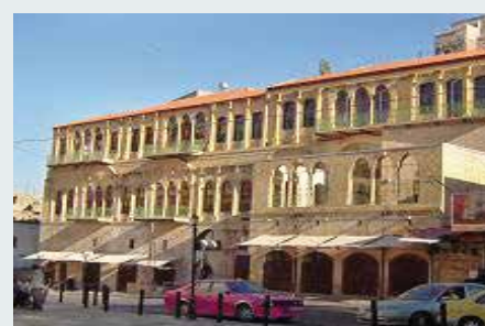
Salt Museum constructed in 1999 with “Tourism Sector Development Project”