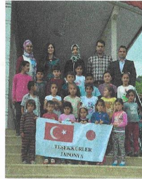
Renovation of the facilities for primary school in Zile

To support Turkey's sustainable economic growth, human resource development and social strength and to promote global cooperation