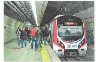
Bosphorus Crossing in Istanbul