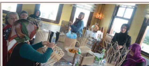
Making textiles at a facility constructed by "The project for Establishment of Vocational Training Center for Women in Rize (2016)"