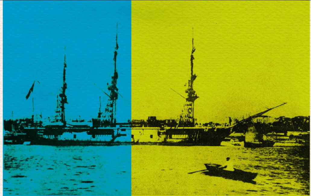
ERTUĞRUL FRIGATE INCIDENT (1890)