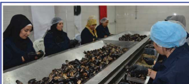
Mussel (Midye) Cooperative by "Promoting self-reliant livelihoods of Syrian under Temporary Protection (SuTP) and host communities through provision of productive assets and skills trainings" in Izmir (2019)