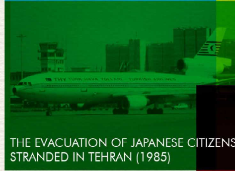
THE EVACUATION OF JAPANESE CITIZENS STRANDED IN TEHRAN (1985)