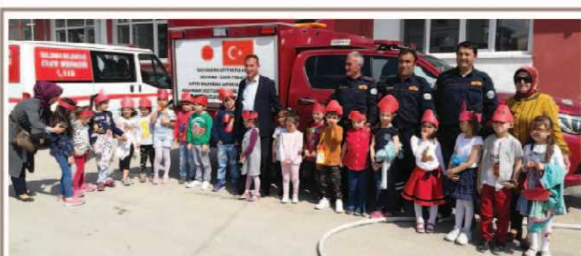
Workshop on disaster prevention prepared by "The Project for Provision of Search and Rescue Vehicle in Suluova (2017)"