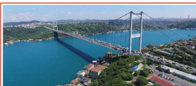
The second bridge built on the famous Istanbul Bosphorus Strait, ZFSM Bridge has been vital in connecting the European side and the Asian side of Istanbul.