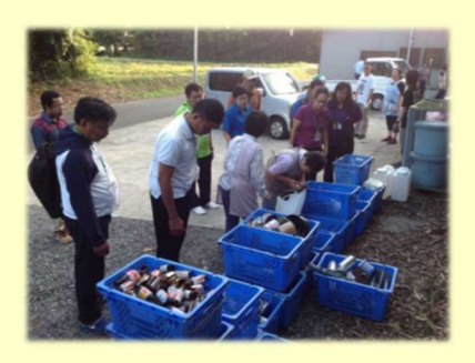
Guidance on garbage separation for trainees from Bali, Indonesia, to Osaki Town

saki Town with a population about 13,000 is located on the Osumi Peninsula in the southeastern part of Kagoshima Prefecture. The Town has invented "Osaki System" that led the Town to achieving the highest resource recycling rate in Japan for 12 consecutive years.