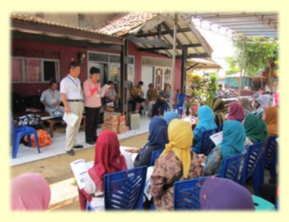
Explanatory meeting in Depok City, Indonesia

The highest resource recycling rate in Japan, Osaki Town's great efforts to achieve the SDGs (Osaki Town, Kagoshima Prefecture)