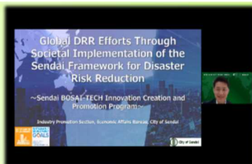
Presentation by City of Sendai