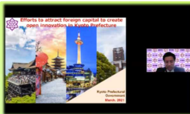
Presentation by Kyoto Prefecture

On March 19, Ministry of Foreign Affairs and Ministry of Economy, Trade and Industry co-sponsored the "Global Business Seminar Achieving Greater Investments in the Digital Era" for embassies in Tokyo, foreign-affiliated companies, Japanese companies, economic and industrial organizations in Japan, local governments, etc. With the participation of about 190 people, discussions focused on expanding investment in the field of digital innovation business were held among government officials, experts and business representatives. In addition, City of Sendai and Kyoto Prefecture gave a presentations on efforts to attract foreign capital to create open innovation, and disseminated the attractiveness as an investment destination.