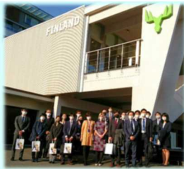
Group photo in front of Metsä Pavilion

M inistry of Foreign Affairs of Japan (MOFA) has implemented the personnel exchange program with local governments of Japan over the past years. In this program, officials from local governments work OJT at MOFA in Tokyo and Embassies or Consulates abroad for several years. On March 23, 2021, 16 trainees currently working at MOFA visited Embassy of Finland in Japan and took lectures on the work of the embassy and bilateral relations between Finland and Japan. The lectures were held in Mezza Pavilion, which was newly established last year in the occasion of the Tokyo 2020. In the sessions, they participated in the discussions with great interest, feeling the real Finnish atmosphere. It was a meaningful opportunity for them to have a practical image of the work in a diplomatic mission abroad.