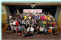
Exchange event between the local residents of Host Towns and visitors from their counterpart countries (August 2019)

On March 17, 2021, young diplomats and government officials from the member states of CARICOM and local citizen from their Host Towns in Kagoshima Prefecture participated in an online exchange event under the "Juntos!! Japan-Latin America and the Caribbean Exchange program". In this event, they visited together their Host Towns (Osaki, Tokunoshima, Amagi, Wadamari, China and Yoron) on the screen and found various local charms such as beautiful nature, traditional culture and local foods. Both participants from CARICOM and the Host Towns share common awareness of the issues on the coastal environmental problem. They had fruitful discussions at the Q&A session on the coastal cleanup activities in Yoron Island.