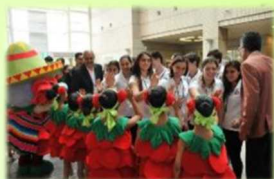
Interaction between students and local residents