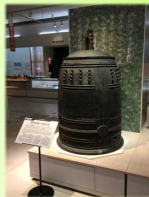
The Bridge of Nations Bell (Okinawa Prefectural Museum & Art Museum)

The history of the emigration from Okinawa goes back in 1899. In the first place, twenty six "Uchinanchu" (people originally from Okinawa) headed from Okinawa to Hawaii. Many years have passed since then, and now about 420,000 Uchinanchu spread throughout all the five continents. Various efforts are being made to activate this world-wide network, namely "Uchina Network", and hand it down to the next generation.