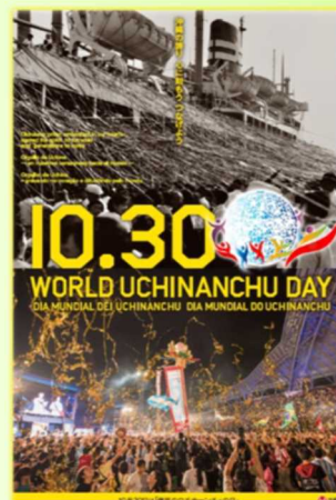
October 30, World Uchinanchu Day