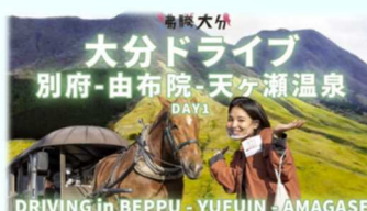
Oita Road Trip part & Ontayaki Pottery Village part

O ita Prefecture keeps delivering the charms of Oita to many people in Japan and overseas! The YouTube channel "Oita Hot Place" was launched in October 2020. Selecting your convenient languages, you'll be navigated to attractive spots in Oita and have experiences in exciting atmosphere. The appearances of many citizens of the prefecture give us a lot of warmth. Now, let's watch the video and catch full of charms of Oita!