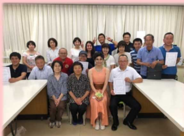
A commemorative photo with Turkish language class students

The beautiful rural life in the southernmost town of the main land of Japan