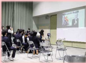
Exchange of opinions