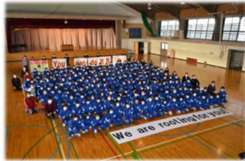
Cheering message from the local citizens in Inawashiro Town to the people in Ghana

D r. Hideyo Noguchi, known as a prominent bacteriologist, was born in Inawashiro Town and passed away in Ghana. There have been various exchanges between Japan and Ghana including the visits of presidents of the republic of Ghana to the town. The town became a Host Town of Ghana for the Tokyo 2020 games and supports the country. "Flowers" that show the support of the local people are now full in bloom in the town.