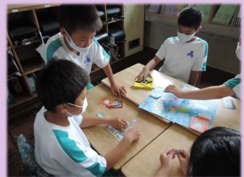
A class using the board game

Ono City of Japan and Orleans City of France give assistance on water to Timor-Leste and Parakou city of Benin respectively. Based on exchanges between Ono and Orleans City starting from 2017, the two cities and Parakou city jointly produced a board game to promote understanding to the importance of water resources. Since "Water Day" on August 1st this year, Ono City has been lending the board game as teaching materials in school classes and also using it on-site lessons. Would you also like to learn about water through the board game?