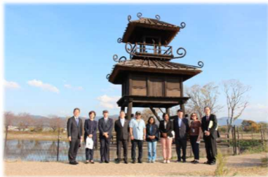
Karako Kagi Remains Historical Landmark Park