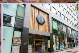
Tottori Okayama Shimbashikan

E xperience the heartfelt "hospitality"! "Tottori Okayama Shimbashikan" is an antenna shop jointly operated by the two prefectures, which was born in Shimbashi in 2014 and reopened after renewal in September 2020. The concept of the shop is expressed by a coined word "MOMOTENASHI", combination of three Japanese words: MOMO(peaches) from Okayama, NASHI(pears) from Tottori and OMOTENASHI(the feeling of hospitality). Let's find a wide range of blessings from the Sea of Japan through Seto inland sea!