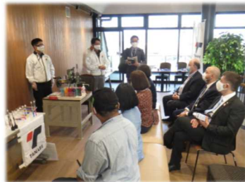
Presentation by local craftsmen

The Ministry of Foreign Affairs of Japan and Tawaramoto Town held a Study Tour to Tawaramoto Town for the diplomatic corps in Japan from November 18 to 19. In this tour, diplomats visited the Karako Kagi Remains related facilities and some sites of local agriculture and other industries of the Town. They deepened their understanding of the area's history, culture and industry.