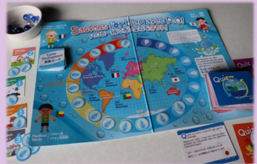
Board game to learn the importance of water