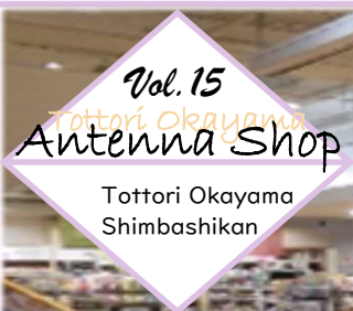
Tottori Okayama Shimbashikan

W e can hear the sizzling sound at any moment! A tweet about Kawara Soba which is the famous cuisine in Shimonoseki City, Yamaguchi Pref. gained the most attention this month. The way in which colorful ingredients are served on the tiles heated at about 300 degrees is very characteristic. It is a hot gourmet that we definitely want to eat in cold winter.